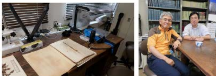
Fig. 6. Working at TI in July, 2019