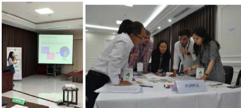
Fig. 8. Join the workshop held in Vietnam in July, 2019