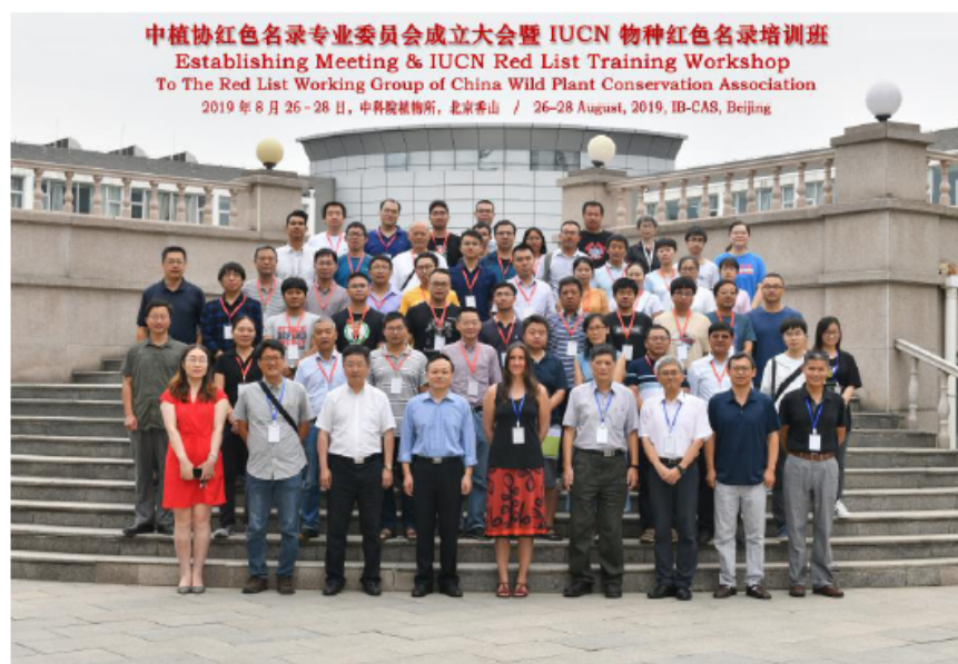
Fig. 1. IUCN Red List Workshop in Beijing, China