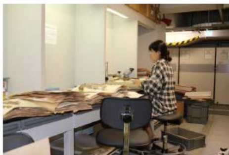
Fig. 7. Working at KYO in August, 2019