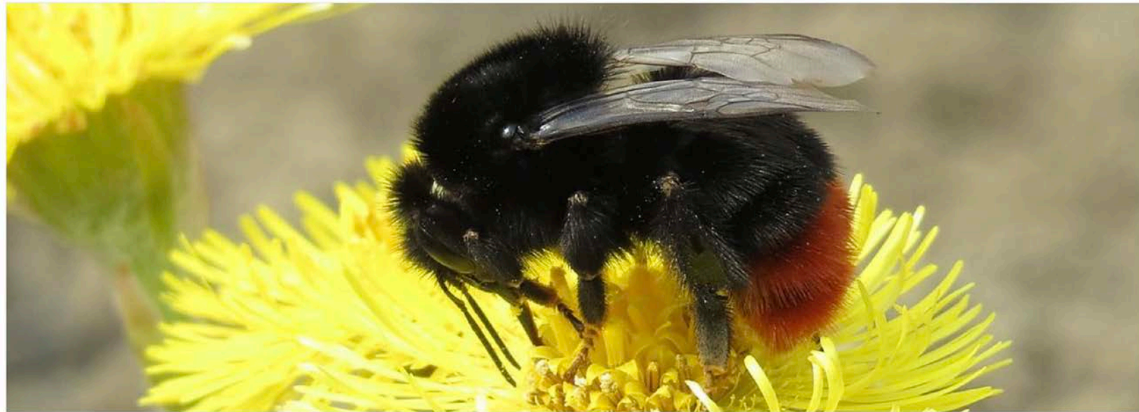
Large red-tailed bumble bee ( Bombus lapidarius ), Mikhailovsky District, Russian Federation.

GBIF partners with FinBIF and Pensoft to support publication of data papers that describe datasets from Russia west of the Ural Mountains