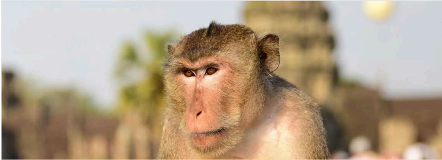
Crab-eating macaque ( Macaca fascicularis ), Angkor Wat, Cambodia.