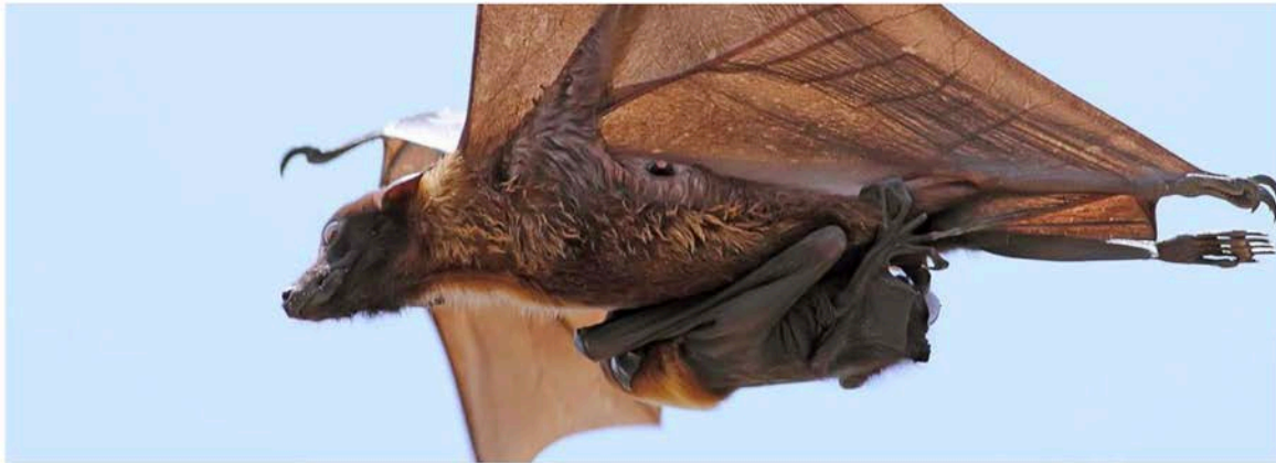
Indian flying fox ( Pteropus giganteus ) by Hemant Kumar via iNaturalist. Photo licensed under CC BY-NC 4.0.

Data resources used via GBIF : 47,942 species occurrences