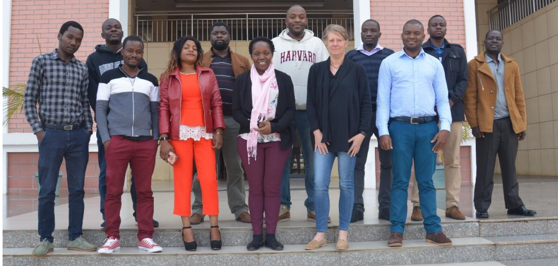
Participants of the CESP-funded course at the Malawi University of Science and Technology