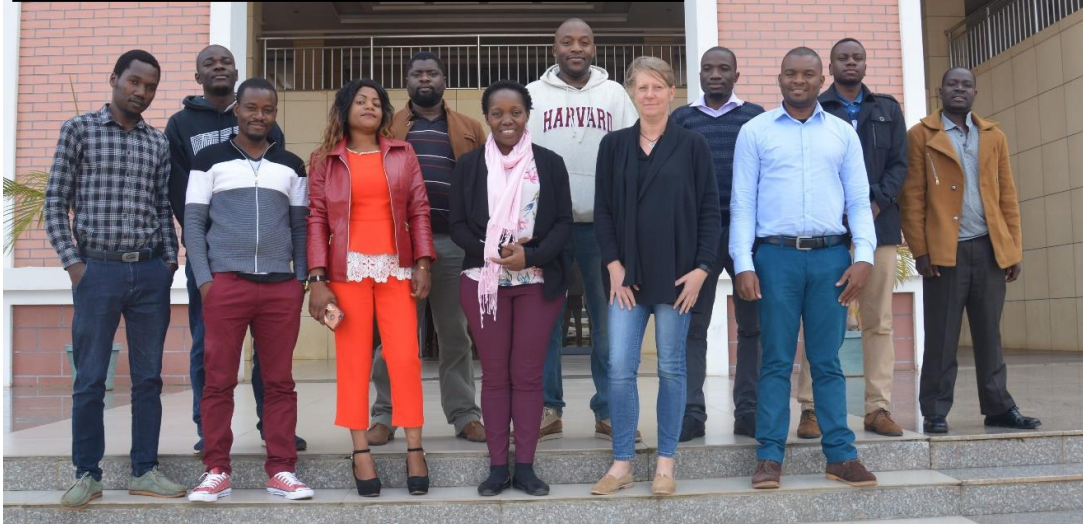
Participants of the CESP-funded course at the Malawi University of Science and Technology