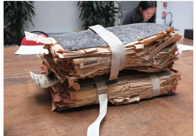
Tixier's old collection from Vietnam