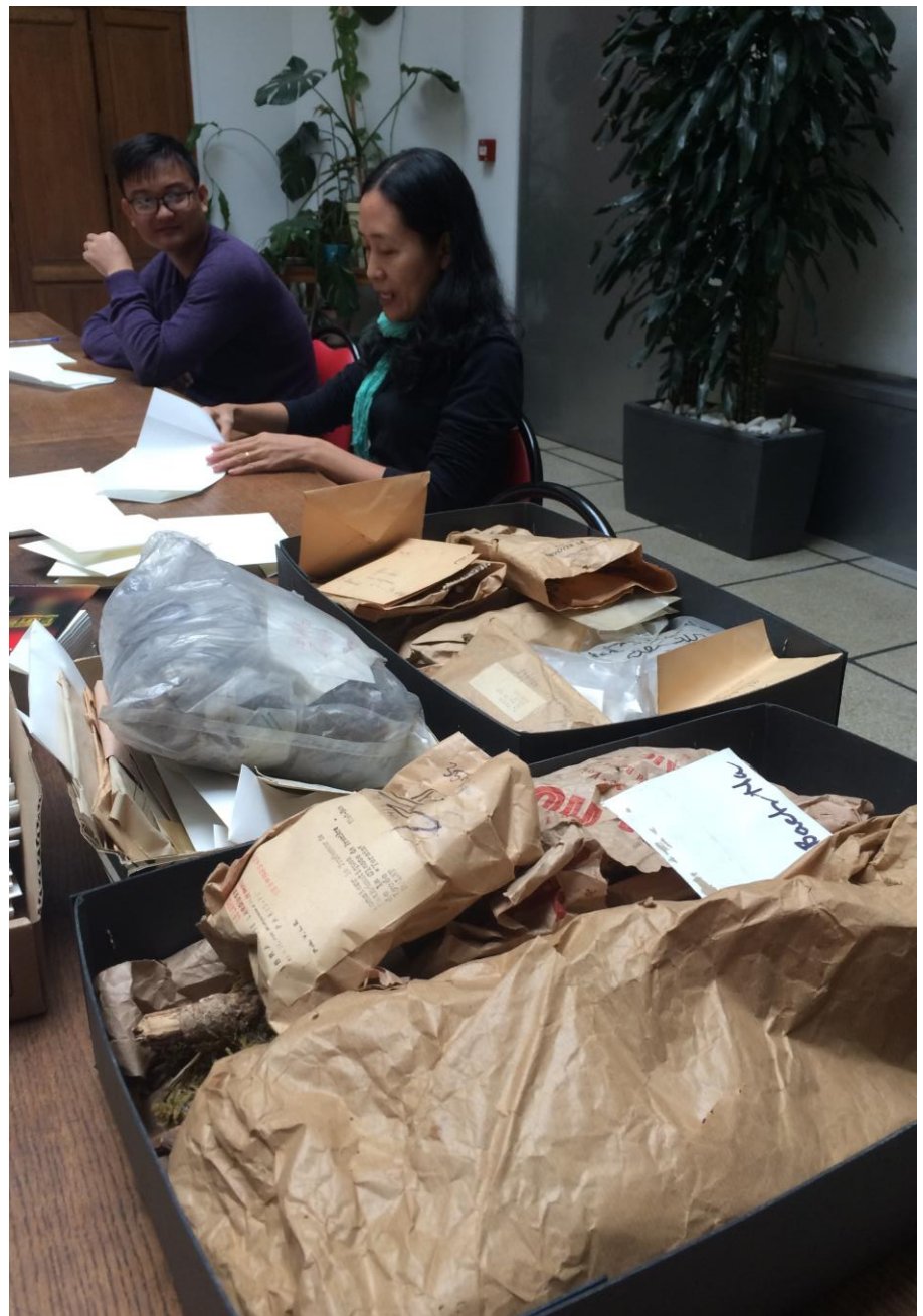
Working on Tixier's old collection