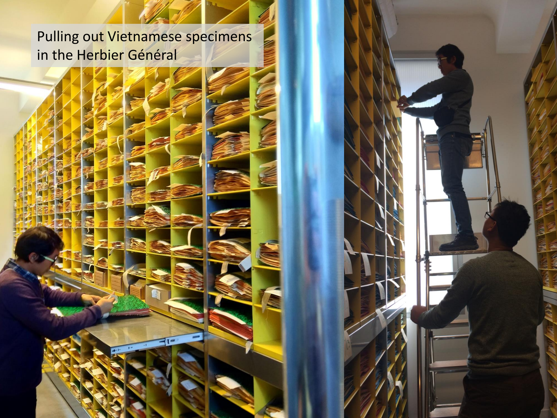
Pulling out Vietnamese specimens in the Herbarium Général