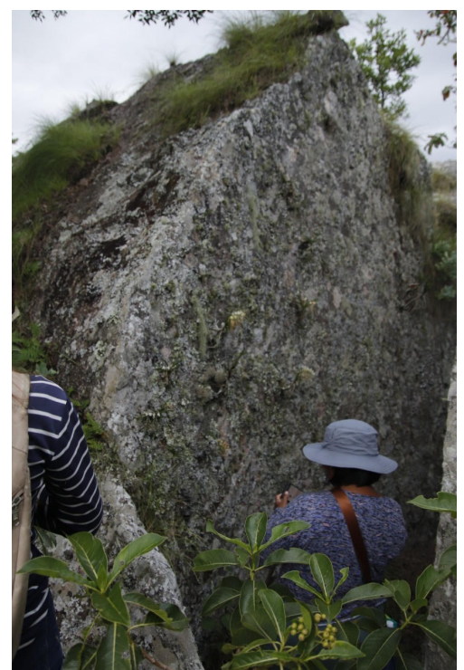
Citizen scientists in field training