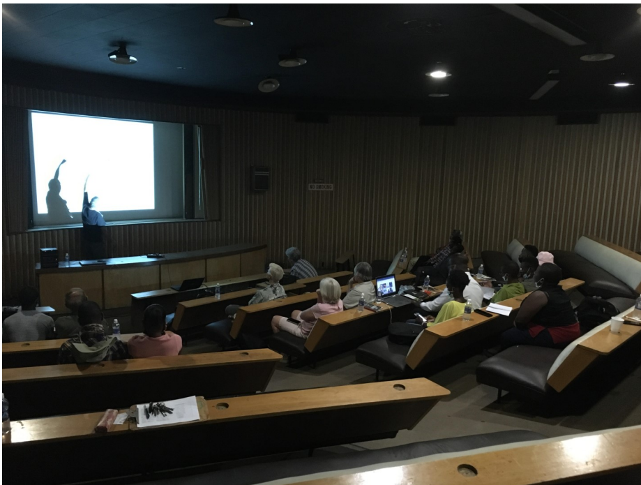
iNaturalist training at the Natural History Museum Zimbabwe 8th March

https://www.inaturalist.org/projects/mukuvisi-woodlands-nature-reserve