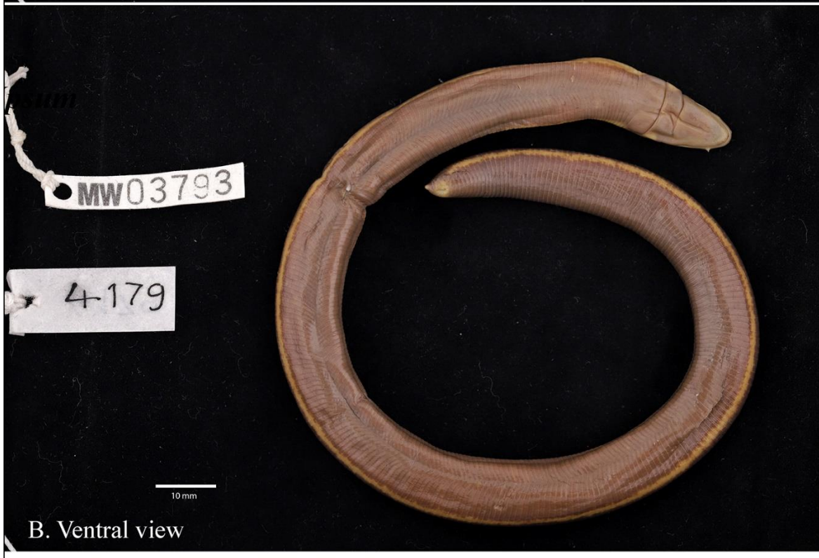
C. Holotype of Ichthyophis kodaguensis showing A. dorsal & B. ventral view