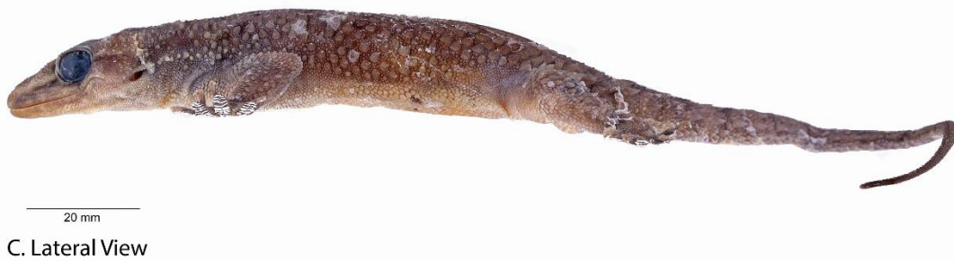
A. Holotype of Hemidactylus kangerensis showing A. Dorsal, B. Ventral & C. Lateral view