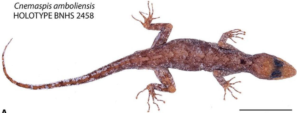
Cnemaspis amboliensis HOLOTYPE BNHS 2458

Amboli (15.960 N, 73.999 E; 735 m asl), Sindhudurg district, Maharashtra, India collected on 23 October, 2015