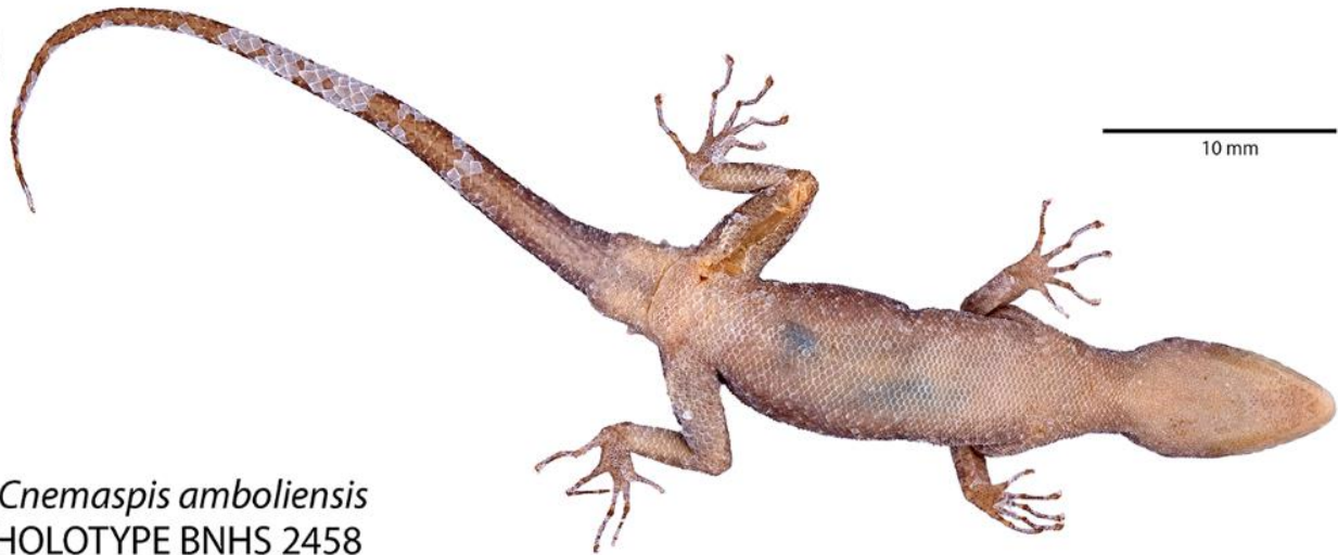
Cnemaspis amboliensis HOLOTYPE BNHS 2458

B. Holotype of Cnemaspis amboliensis showing A. dorsal & B. ventral view