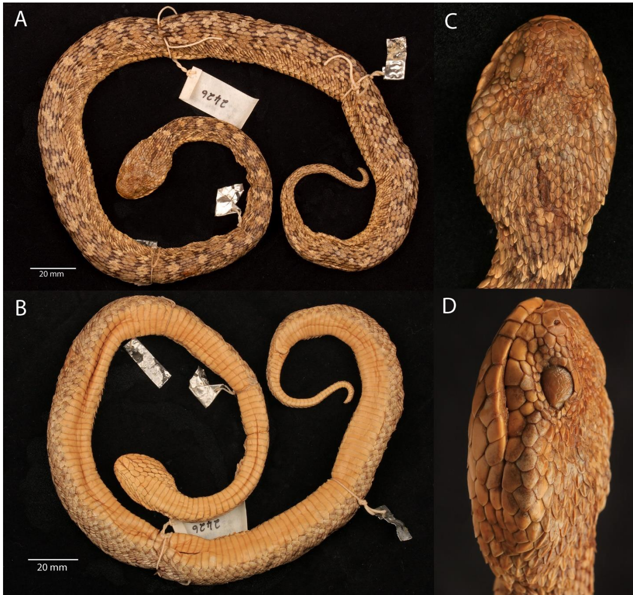
D. Specimen of Echis carinatus sochureki showing A. full body dorsal, B. full body ventral, C. dorsal view of head & D. lateral view of head