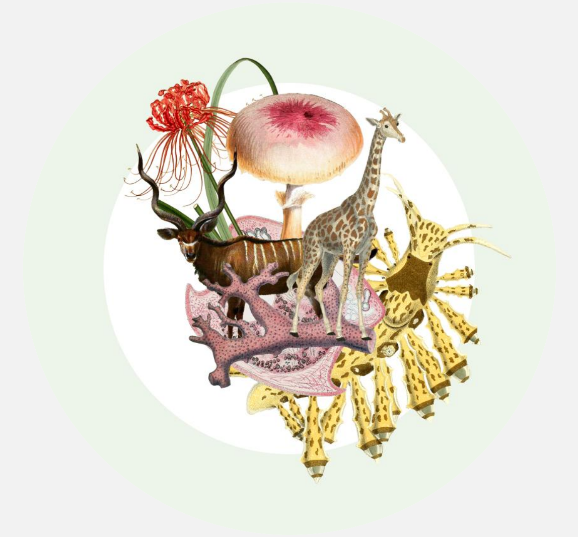
Accessibility and affordability