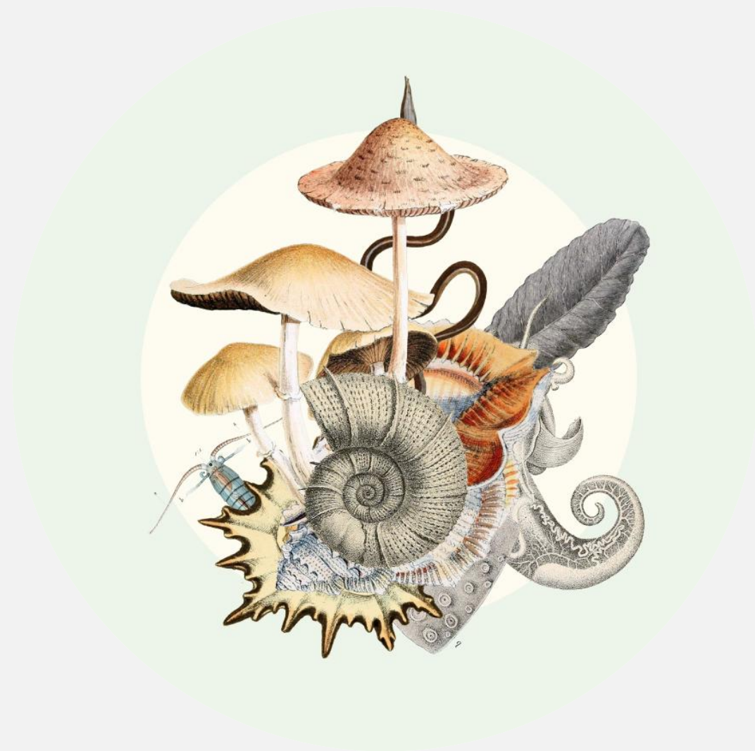
Inclusivity and regional balance