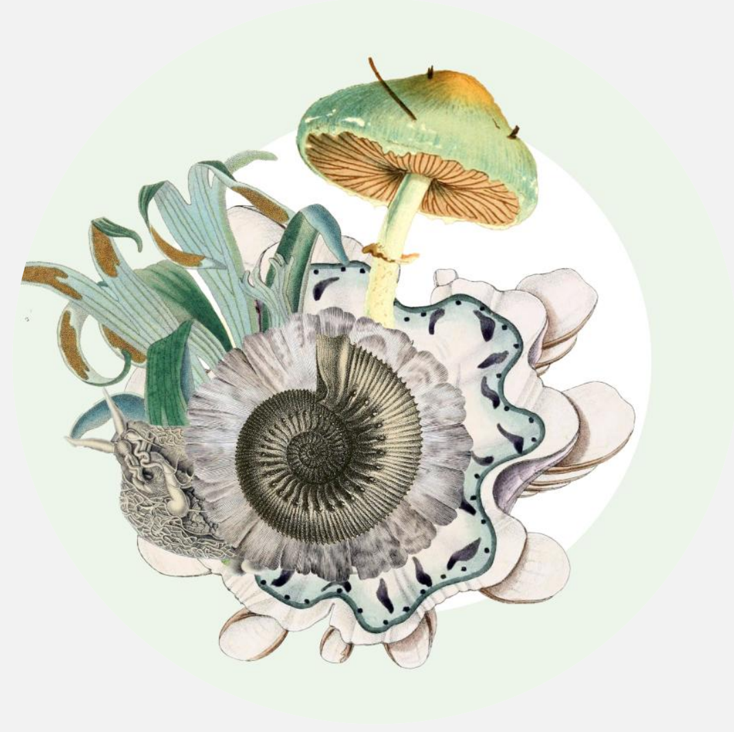
Capacity to host