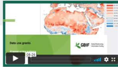
Data use grant