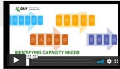
Identifying capacity needs