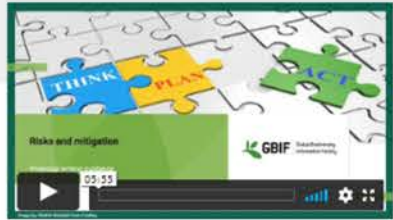
Risks and mitigation

Informational videos and tutorials for helping you successfully apply for funding through a GBIF-managed grant programme