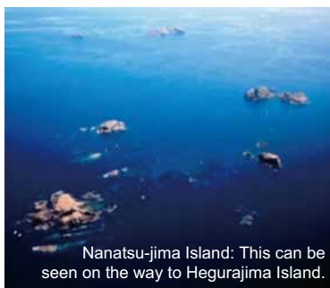
Nanatsu-jima Island: This can be seen on the way to Hegurajima Island.

■ Enquiries: Hegura Kouro Co., Ltd (Tel: 0768-22-4381) (90 minutes, 1 return trip per day). http://www11.ocn.ne.jp/~hegura/index.html (Japanese)