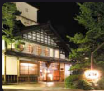
Houshi (Awazu Onsen) MAP-5

http://www.ryokancollection.com/eng/kayotei/ryokan_story.htm?ryokan=kayotei