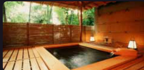
Beniya Mukayu (Yamashiro Onsen) MAP-3

This is the only place in the Hokuriku region that is a part of the Relais & Châteaux. (※1) This resort home like inn is surrounded by mountains sprawling with greenery. It is built in a way that creates a sense of openness with the blending scenery outside.