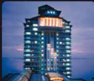
Kagaya (Wakura Onsen)

Ishikawa is scattered with onsen hot springs with history including the Kaga Onsen Hot Spring Village which has some of the Hokuriku region's best, and open air baths such as the Wakura Onsen that has been around since the Heian period. With so many hot springs in different locations you can relax in onsens with views of the sea, rivers, trees and more. Ishikawa Prefecture has a lot hot spring lodges and in this issue we'll be giving a brief insight into some of the ones that have particular features. For further details please check the links provided.