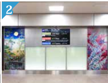
2 Beautiful Washi and Kagayuzen on the wall