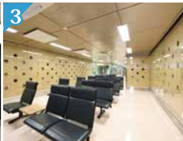
3 236 traditional arts and crafts in a waiting room