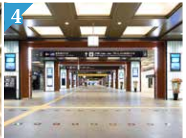
4 24 Tsuzumi Gate-shaped pillars