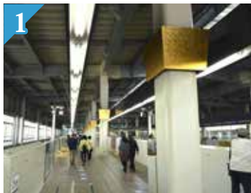
1 More than 20,000 gold leaves on the pillars at Shinkansen platform