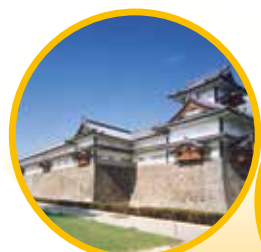
Kanazawa Castle Park Hishi Yagura / Gojikken Nagaya / Hashizume-mon Tsuzuki Yagura / Hashizume-mon