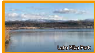
Lake Kiba Park