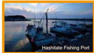
Hashitate Fishing Port