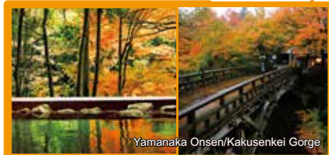
Yamanaka Onsen/Kakusenkei Gorge