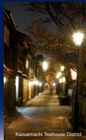
Kazuemachi Teahouse District