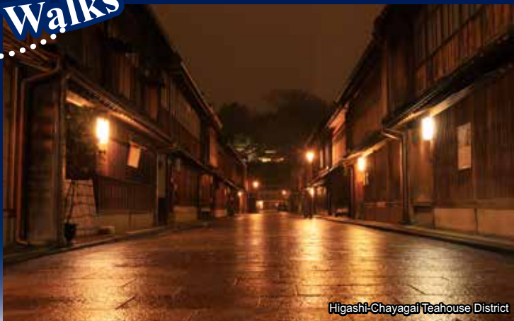
Higashi-Chayagai Teahouse District

Access: 7min via bus from Kanazawa Station's Kenrokuen (Eastern) Exit → Get off at Hashiba-cho bus stop → 5min walking