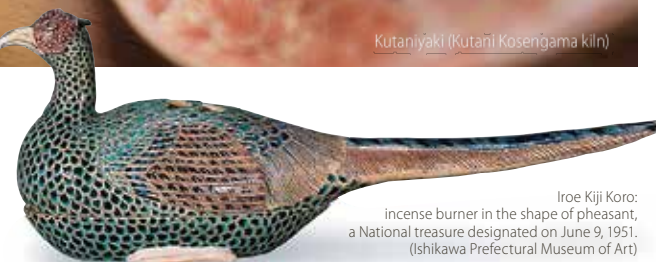
Iroe Kiji Koro: incense burner in the shape of pheasant, a National treasure designated on June 9, 1951. (Ishikawa Prefectural Museum of Art)

Just down the street, you'll find the Museum for Traditional