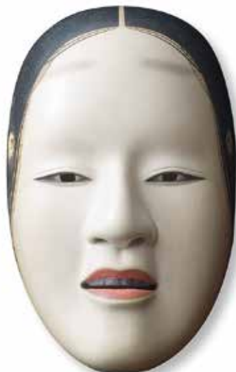
Noh Mask

"The city of Kanazawa began as a center of Buddhism in 1546 when the Ikko Sect built Gobo Temple on the site of what is now