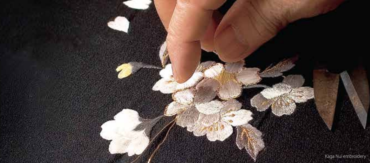
Kaga Nui embroidery