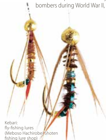
Kebari: fly-fishing lures (Meboso Hachirobei Shoten fishing lure shop)

Kanazawa has maintained its otherworldly charm, from the remains of Kanazawa Castle down into the picturesque geisha and samurai districts. Centered around the area known as Nagamachi located at the foot of the castle, former samurai homes are tucked away behind thick ochre mud walls topped with distinctive clay or wooden tiles. During Kanazawa's snowy winters, woven straw mats protect the walls, designed to prevent freezing and splitting. Private entrances shield modern