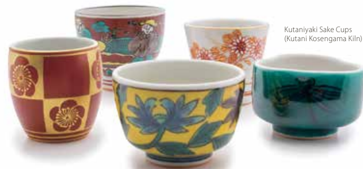
Kutaniyaki Sake Cups (Kutani Kosengama Kiln)

Sharing the same vivid Kaga gosai palette is the ceramic tradition of Kutaniyaki. For over 200 years, their artisans have created fantastic, often decadent tableware, often incorporating generous helpings of gold as well. Used for everything from ceremonial occasions to home décor, Kutaniyaki has been collected and passed down for generations, even as contemporary artisans work to sustain and revitalize the line. From