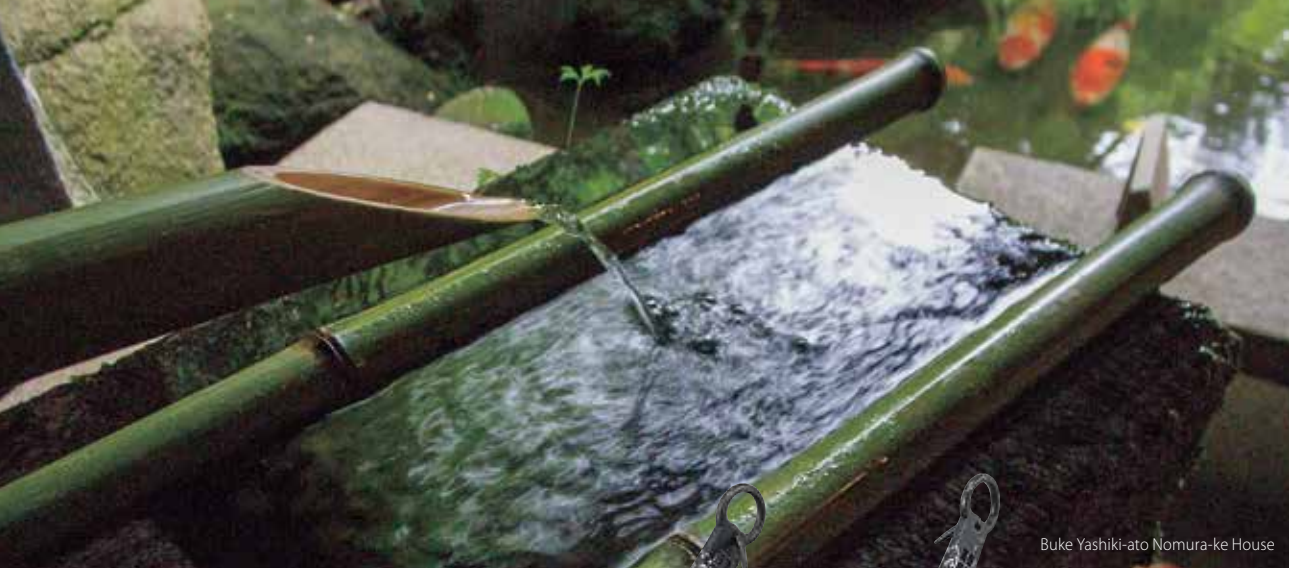
Buke Yashiki-ato Nomura-ke House