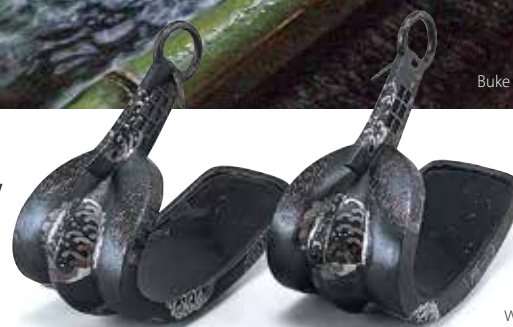
Abumi: stirrups with Kaga Zogan decoration

occupants from curious passers-by, but fortunately there are several residences and shops open to the public where visitors can experience the striking architecture and refined taste of these multi-faceted fighters.