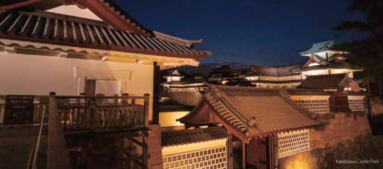
Kanazawa Castle Park