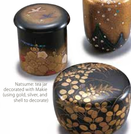
Natsume: tea jar decorated with Makie (using gold, silver, and shell to decorate)

Kanazawa has maintained its otherworldly charm, from the remains of Kanazawa Castle down into the picturesque geisha and samurai districts. Centered around the area known as Nagamachi located at the foot of the castle, former samurai homes are tucked away behind thick ochre mud walls topped with distinctive clay or wooden tiles. During Kanazawa's snowy winters, woven straw mats protect the walls, designed to prevent freezing and splitting. Private entrances shield modern