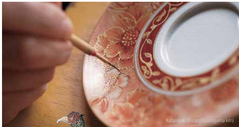
Kutaniyaki (Kutani Kosenigama kiln)