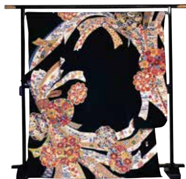
Kaga Yuzen Kimono

government, forcing it underground until an official license was granted in 1845. Today, Kanazawa accounts for 99% of the gold leaf produced in Japan, although much of the raw material is now imported. While the Maeda family