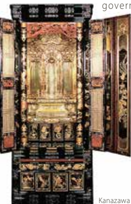
Kanazawa Butsudan Buddhist Altar