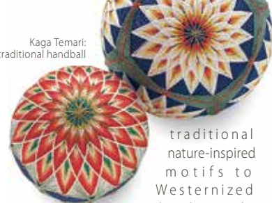
traditional nature-inspired motifs to Westernized modern designs, the

current Kutaniyaki workshops continue to create beautiful original works that emphasize quality and skill.