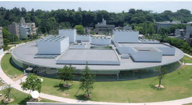
21st Century Museum of Contemporary Art ↑↔ D.T. Suzuki Museum ↘ Kanazawa Station ↓

Kanazawa took its place in Nippon history when it became the capital city of the Kaga province, the biggest in Japan during the 16th century. Around the Maeda clan's imposing castle, soon stood majestic samurai houses, rich warehouses, craftsmen's ateliers and numerous temples. During the Edo period (1603-1868), the city saw the development of a particularly refined culture. It was so thriving that it became Japan's fourth town after Tokyo, Osaka and Kyoto. Time went by, sparing Kanazawa from natural disasters and wars. That is why Kanazawa appears today as an amazing conservatory for ancient Japanese traditions and artistic refinement. The intact old market, geisha districts, samurai or craftsmen quarters make it one of Japan's most enjoyable historic centres, without forgetting its most exquisite culinary traditions. Registered in UNESCO's Creative Cities Network in the field of Crafts and Folk Arts, Kanazawa has also known how to anchor itself in our time with remarkable architectural realisations such as its station or the 21st Century Museum of Contemporary Art.