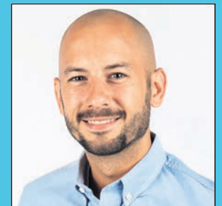
Will Campbell The Columbian