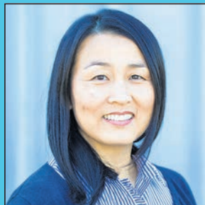
Esther Liu LSW Architects