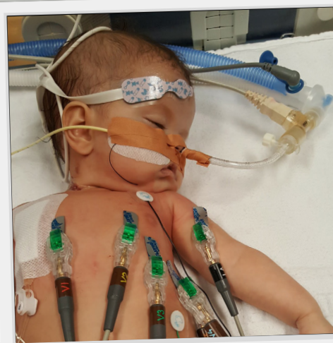
It was a long, scary journey