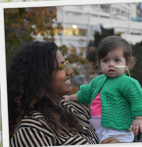
Such a great feeling to take Poppy home