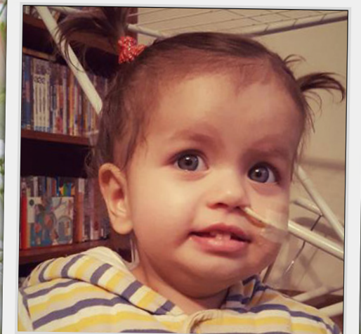
Poppy has come such a long way