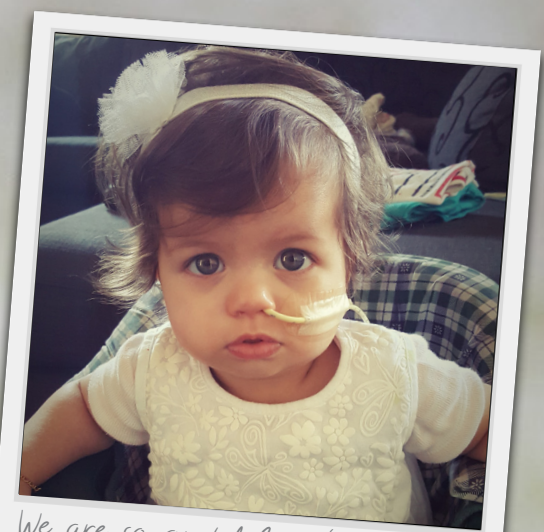
We are so grateful to have Poppy home.