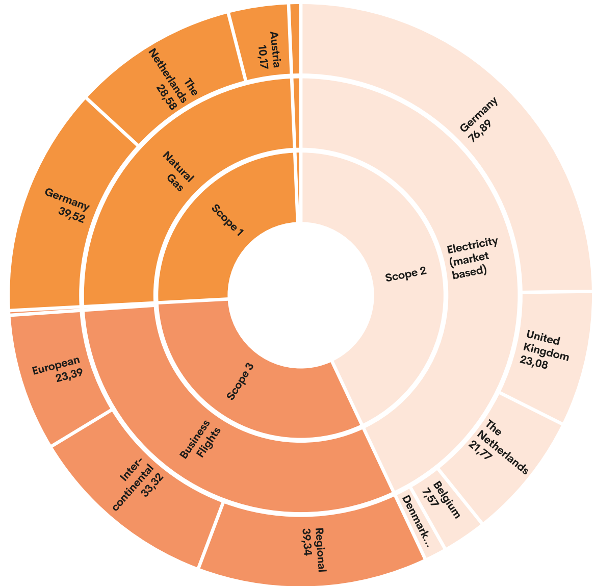
Table 2: Emissions in Ton CO2-eq per scope