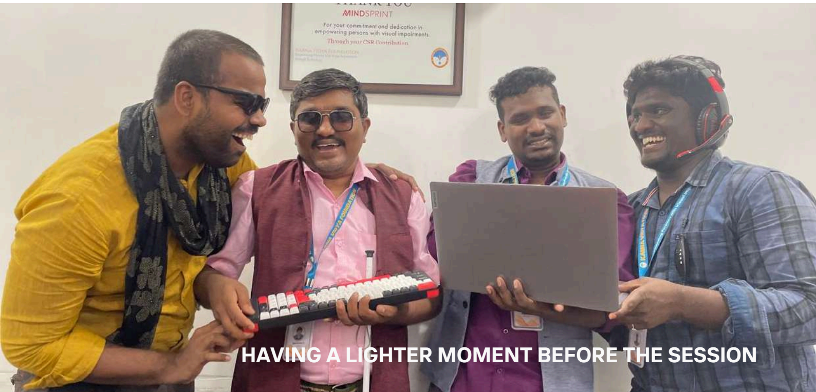
HAVING A LIGHTER MOMENT BEFORE THE SESSION