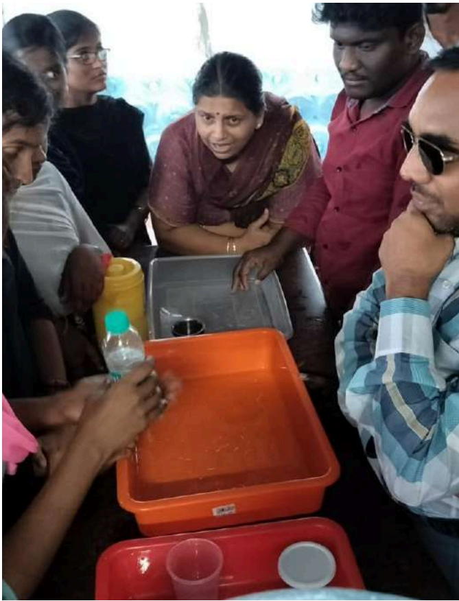
VALAR PIRAI Training Program at KVTC,Guindy