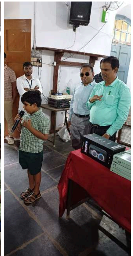
Digital Literacy Programme at Salem