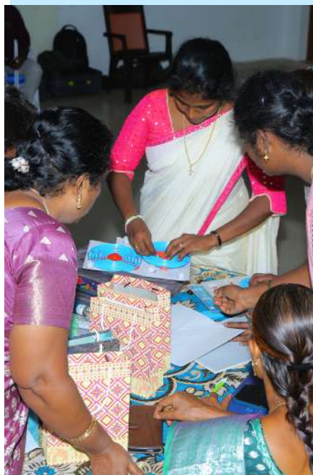
ASAM- Alternate skills and adaptive materials- One day workshop for special educators in krishnagiri

The celebration concluded with the distribution of smartphones, generously provided by our CSR partner, Mindsprints, to students who achieved excellent marks.