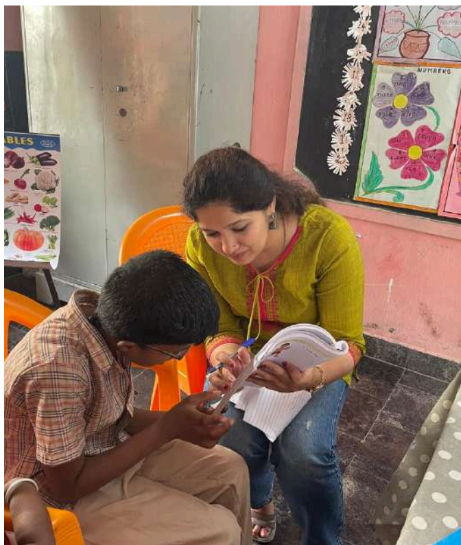
KVF employee interacting with a child during block survey in Krishnagiri