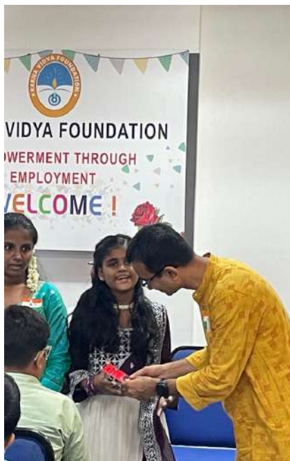
Independence day celebration at KVF