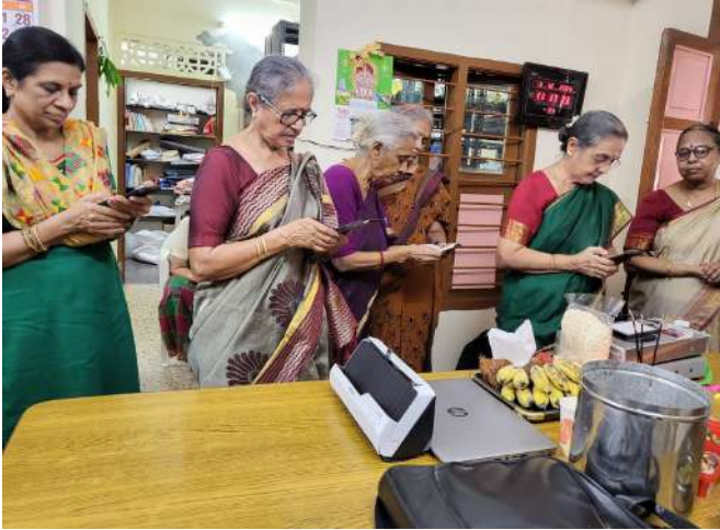
Dedicated team of KVF library volunteers