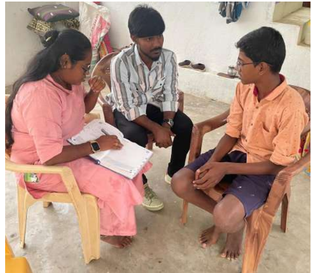
KVF team interacting with school student at Bargur, Krishnagiri

"Project Oasis seeks to deliver quality education to students with visual impairments enrolled in government and government-aided schools in Krishnagiri.