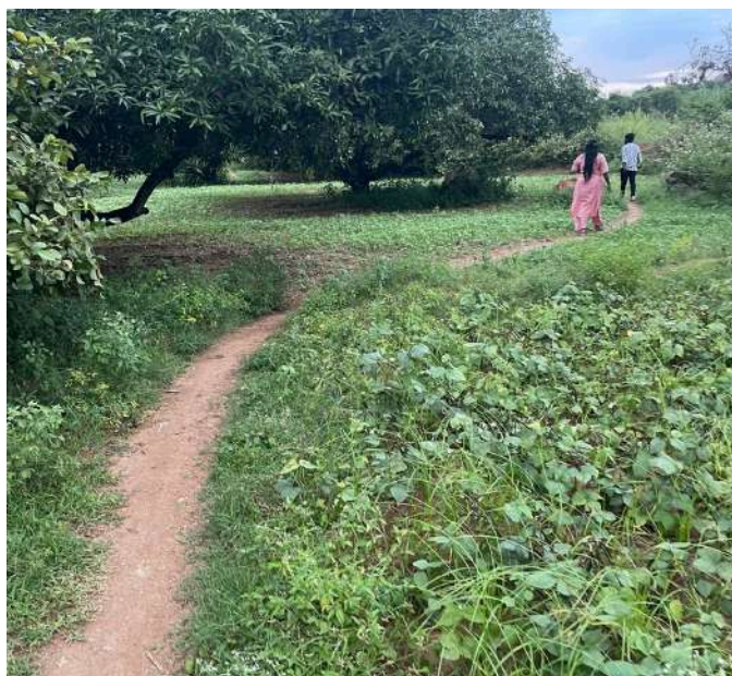
KVF team visiting remote locations for field visits in Bargur Block, Krishnagiri