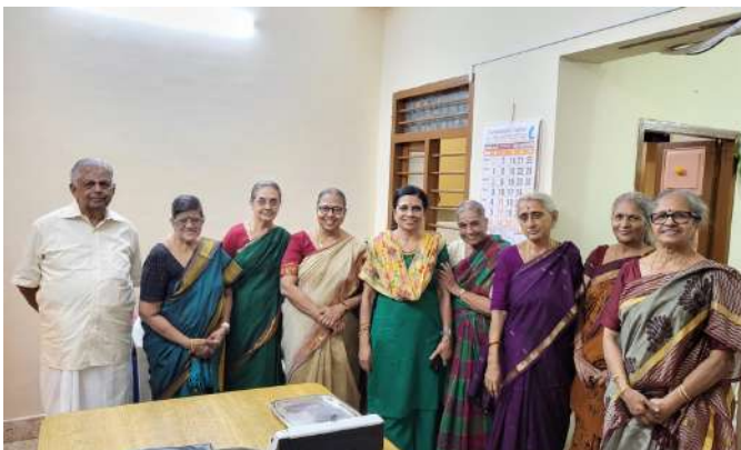
Dedicated team of KVF library volunteers

Volunteers now enthusiastically use tools for scanning, converting, and uploading books, enhancing the quality and reach of the resources available to students. This ongoing commitment underscores the foundation's pivotal role in fostering inclusivity and empowering visually impaired learners.