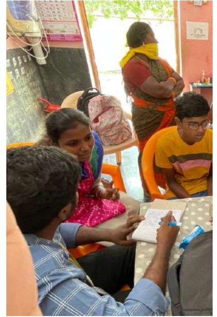
KVF team interacting with a child during the block survey in Krishnagiri