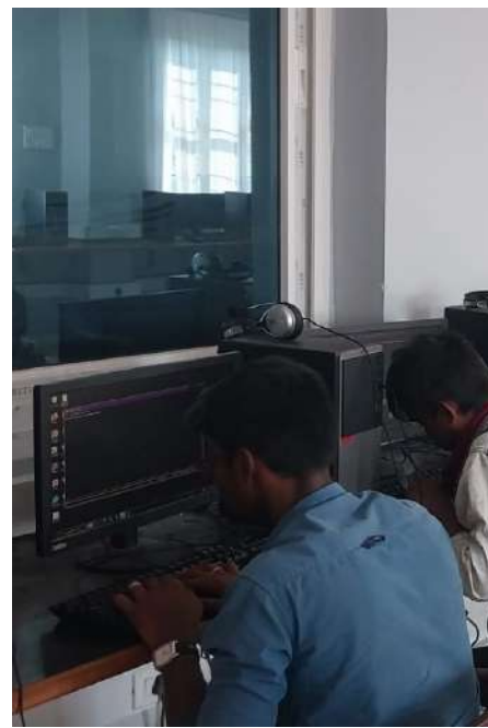
Orientation workshop for 12th toppers at KVF

The workshop was attended by 38 special educators under the SSA (Sarva Shiksha Abhiyan).