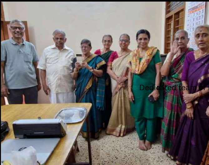
Dedicated team of

Compiled by Khyati Goswami