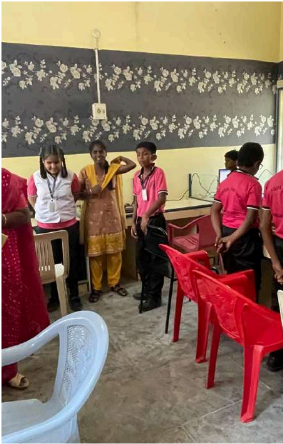
KVF team visiting I.E.L.C school ,Bargur