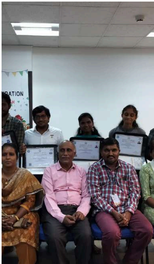
The first batch of Data Entry Operator course