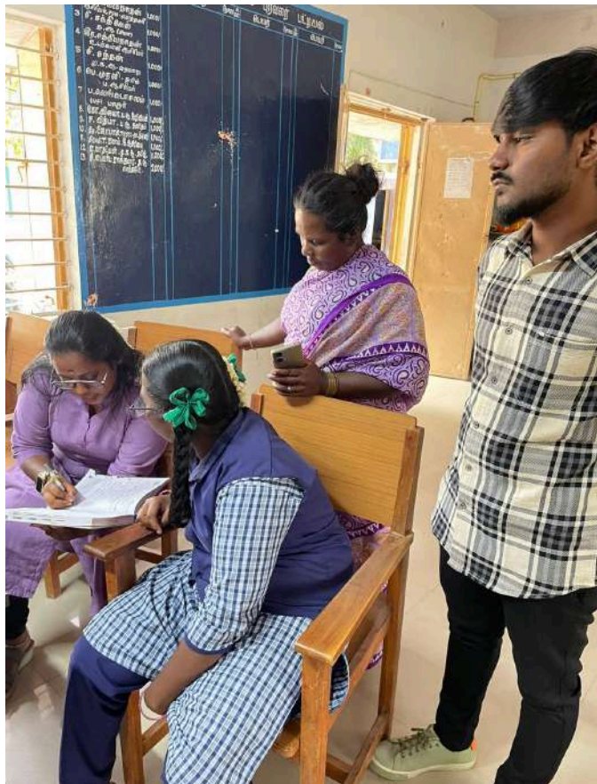
KVF team conducting an assessment of the student at Oppathavadi GHSS school.