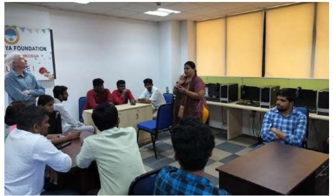
VALAR PIRAI Training Program at KVTC,Guindy

The Training of Trainers (ToT) course was successfully conducted to develop skilled trainers capable of teaching students with visual impairments.