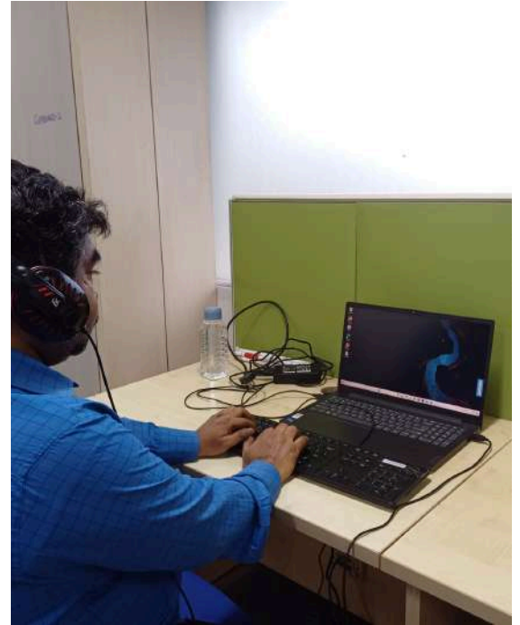
Students undergoing the digital literacy program