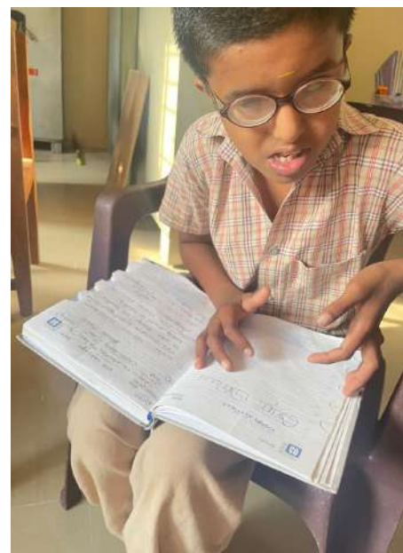
Student in Bargur, Krishnagiri

"The special educators from Samagra Shiksha are doing remarkable work in providing education to children with disabilities. Their on-the-ground expertise and personal engagement with each child are truly commendable.