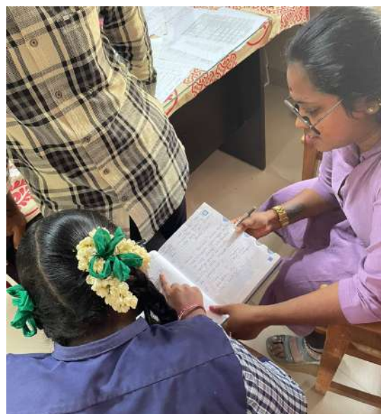
KVF team interacting with the child at Bargur, Oppathavadi school in Krishnagiri district.