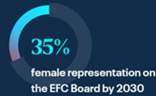
EFC Board (Members + Observers) Gender Distribution