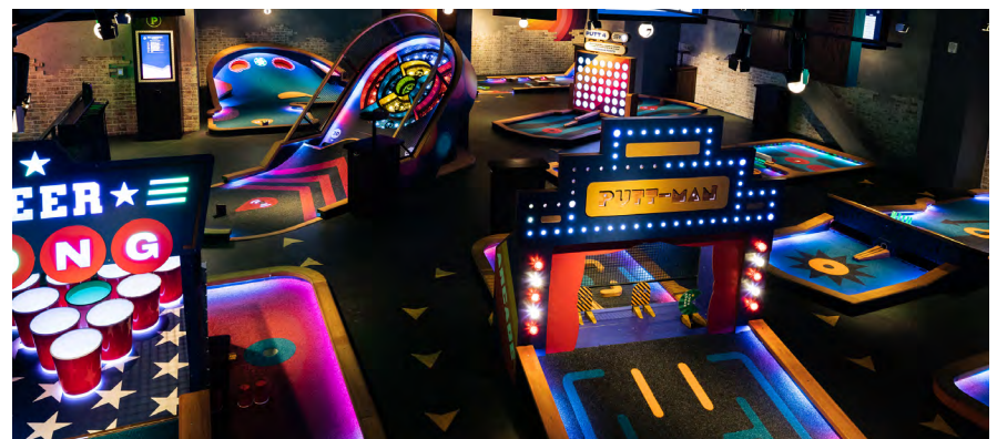
ADDITIONAL ROUND OF MINI GOLF