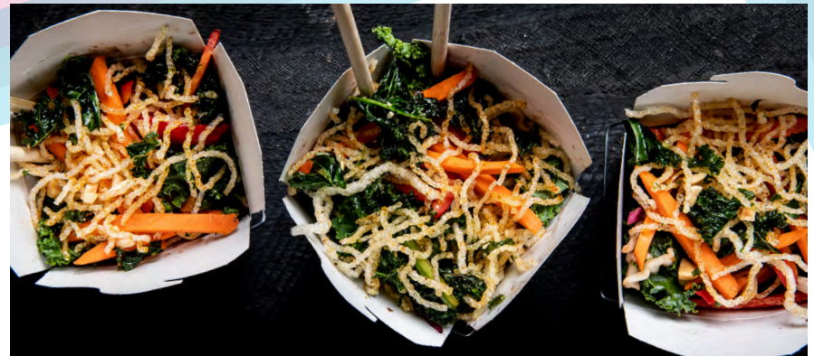
VEGETARIAN & VEGAN PLATTERS