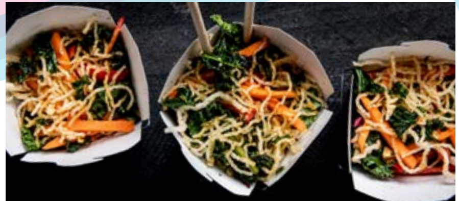
VEGETARIAN & VEGAN PLATTERS