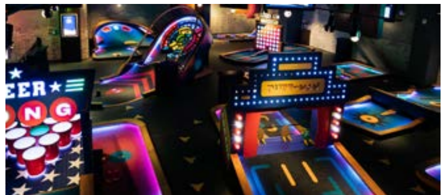
ADDITIONAL ROUND OF MINI GOLF