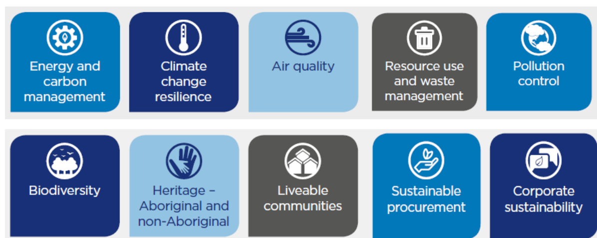
Figure 25.4 Environmental Sustainability Strategy 2019-2023 sustainability focus areas