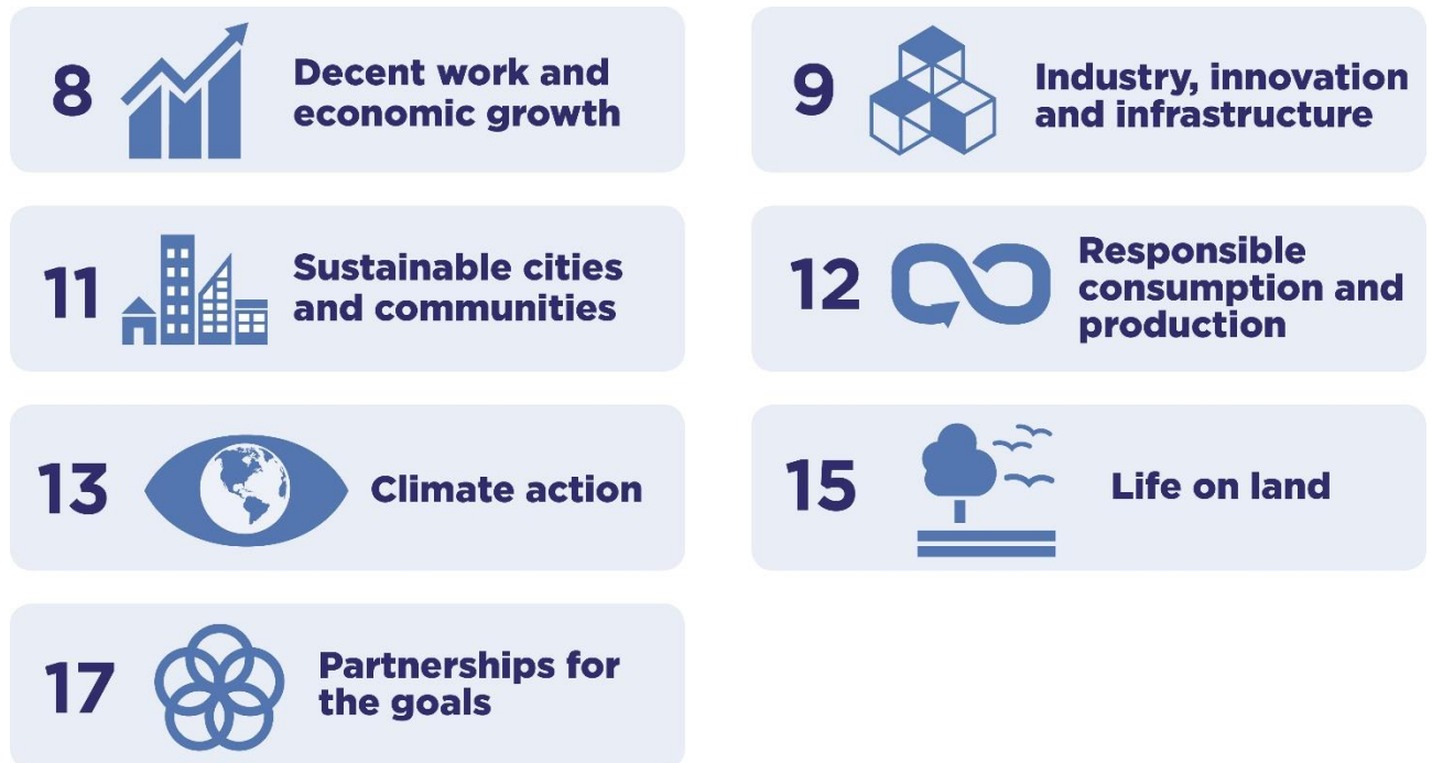
Figure 25.3 2030 Agenda for Sustainable Development – goals relevant to the project