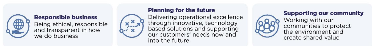
Figure 25.5 Sydney Airport Master Plan 2039 – Approach to sustainability

The approach to sustainability at Sydney Airport is categorised into the three sustainability pillars shown in Figure 25.5.