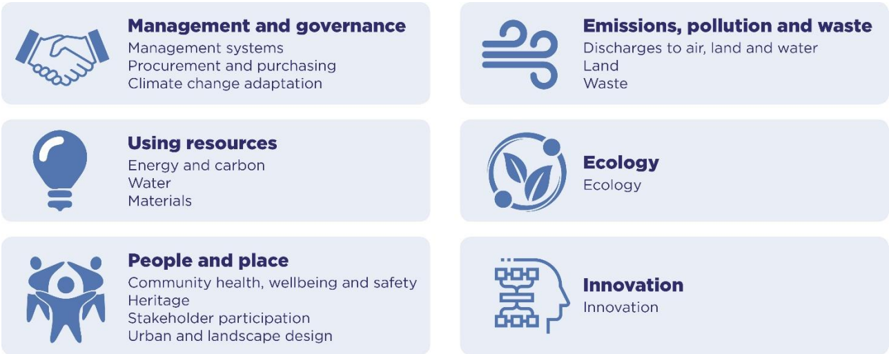
Figure 25.1 IS rating scheme version 1.2 themes and categories

Version 1.2 of the rating scheme would be applied to the project. Using the rating scheme, credit points are allocated for providing verified evidence of sustainability actions across different performance categories which are then totalled to achieve an overall project score. The ‘Design’ and ‘As Built’ ratings would be applied to the project. The ‘Design’ rating is an interim verification step after detailed design is completed. This interim rating is later replaced with the ‘As Built’ rating, which covers both the design and construction stages. The themes and associated performance categories are shown in Figure 25.1.