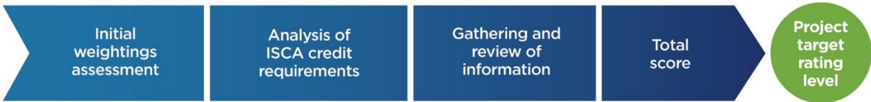
Figure 25.2 Infrastructure sustainability rating scheme methodology

Under the rating scheme, each project is allocated a calculated rating based on a score out of 100, with an additional 10 points available for innovation.