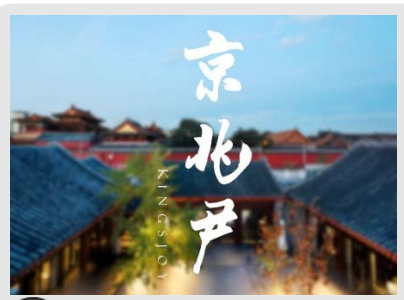
(a) (a) (a) *Based on 234 reviews