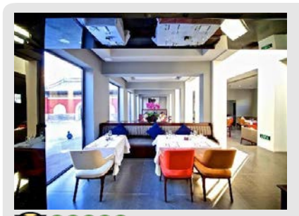
*Based on 1206 reviews