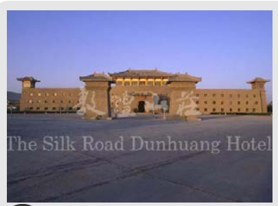
*Based on 311 reviews