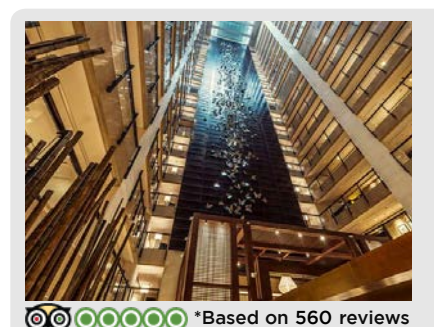
FOUR SEASONS HOTEL BEIJING