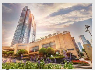
® ® ® ® *Based on 1722 reviews