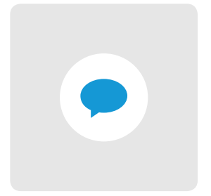
LANGUAGE Mandarin, Cantonese