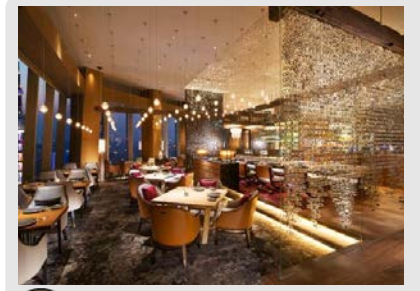
*Based on 317 reviews

Went for a Sunday lunch treat, I was craving for a Adana Kebab. I got some humus with. Both very delicious. The owner took good care and offered me a Turkish coffee by the end of my meal I'll be back soon.