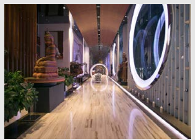
*Based on 644 reviews