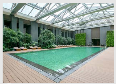
*Based on 299 reviews