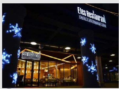
*Based on 632 reviews