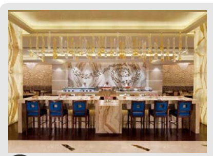
*Based on 35 reviews