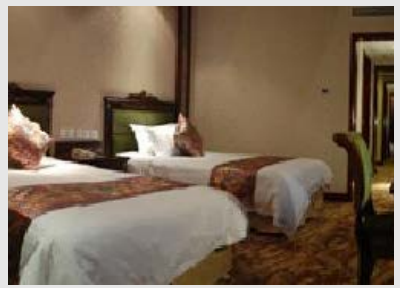
*Based on 59 reviews