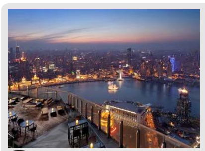
*Based on 1217 reviews