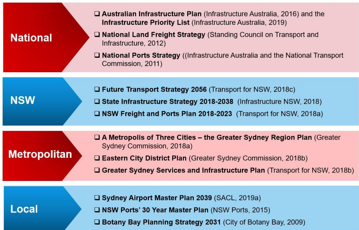
Figure 5.3 Strategic planning context – key strategies

A description of each of these strategies and plans, and their relationship to the project, is provided in Appendix F.