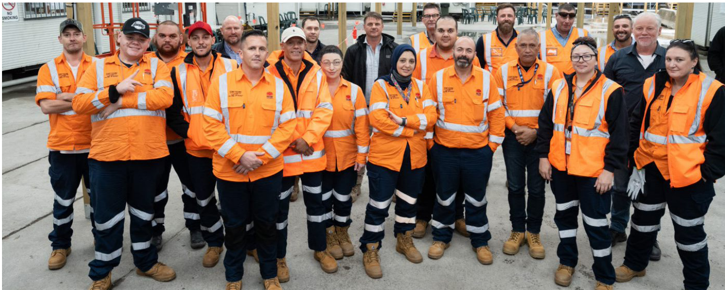
Image: Our Pre-Employment Training graduation ceremony.

The project celebrated the graduation of 13 trainees in our first Pre-Employment Training Program earlier this month. A group of 9 men and 4 women successfully completed the intense 4-week program of both knowledge and practical sessions. They have now started full time work on Sydney Gateway while doing either an Apprenticeship or Traineeship.