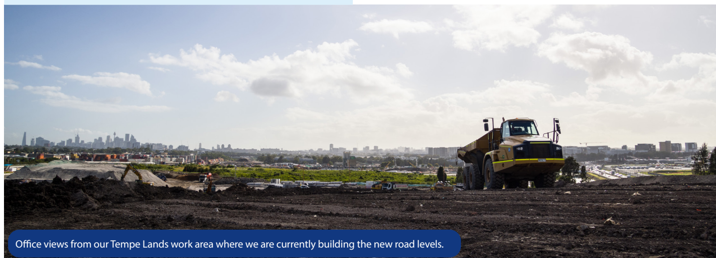
Office views from our Tempe Lands work area where we are currently building the new road levels.

You can tell us what you think in this short survey .