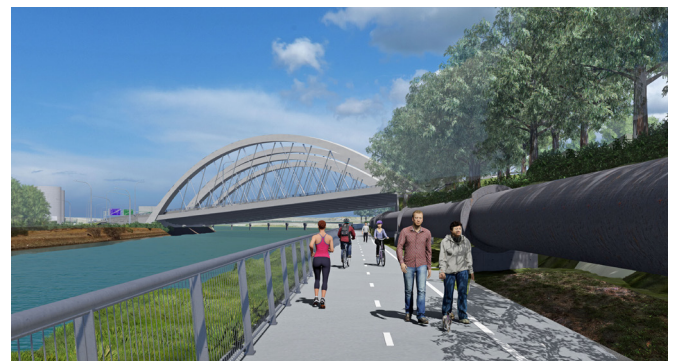
Image: Artist impression of the new shared path and arched bridge over Alexandra Canal.