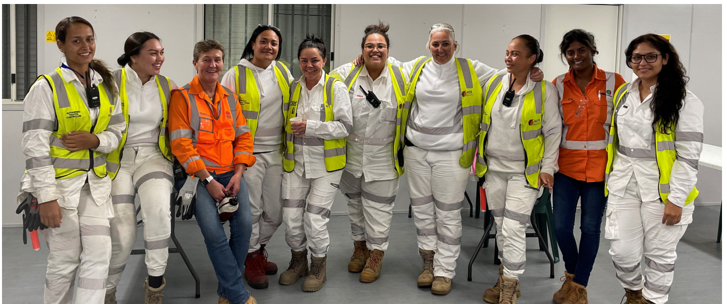
Image: Our glowing nightshift crew keep our workers, motorists and cyclists safe around our work areas, while coordinating heavy vehicle movements to and from our work sites.

Here's how we honoured the women in our workforce on International Women's Day last month.