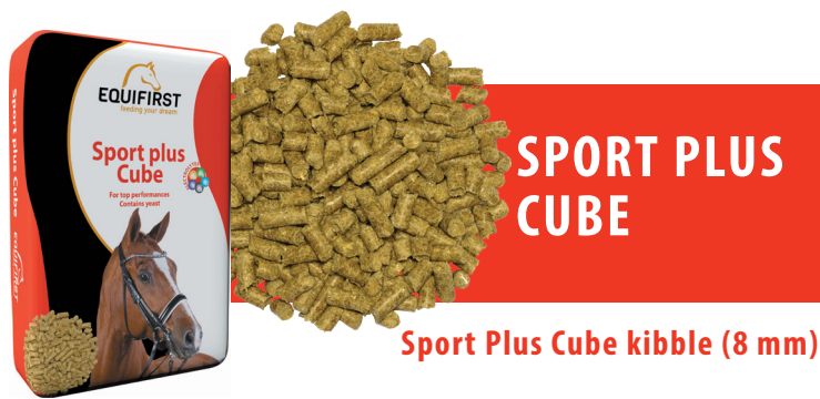
Sport Plus Cube kibble (8 mm)

Sport Plus Cube is a pellet that has been specifically designed for performance-oriented horses. This energy-rich pellet, with omega 3 & 6 fatty acids, contains extra vitamin E, organically bound selenium and magnesium to provide extra support for the muscles. The added electrolytes quickly alleviate any deficiencies of essential minerals. The added yeast supports digestion.