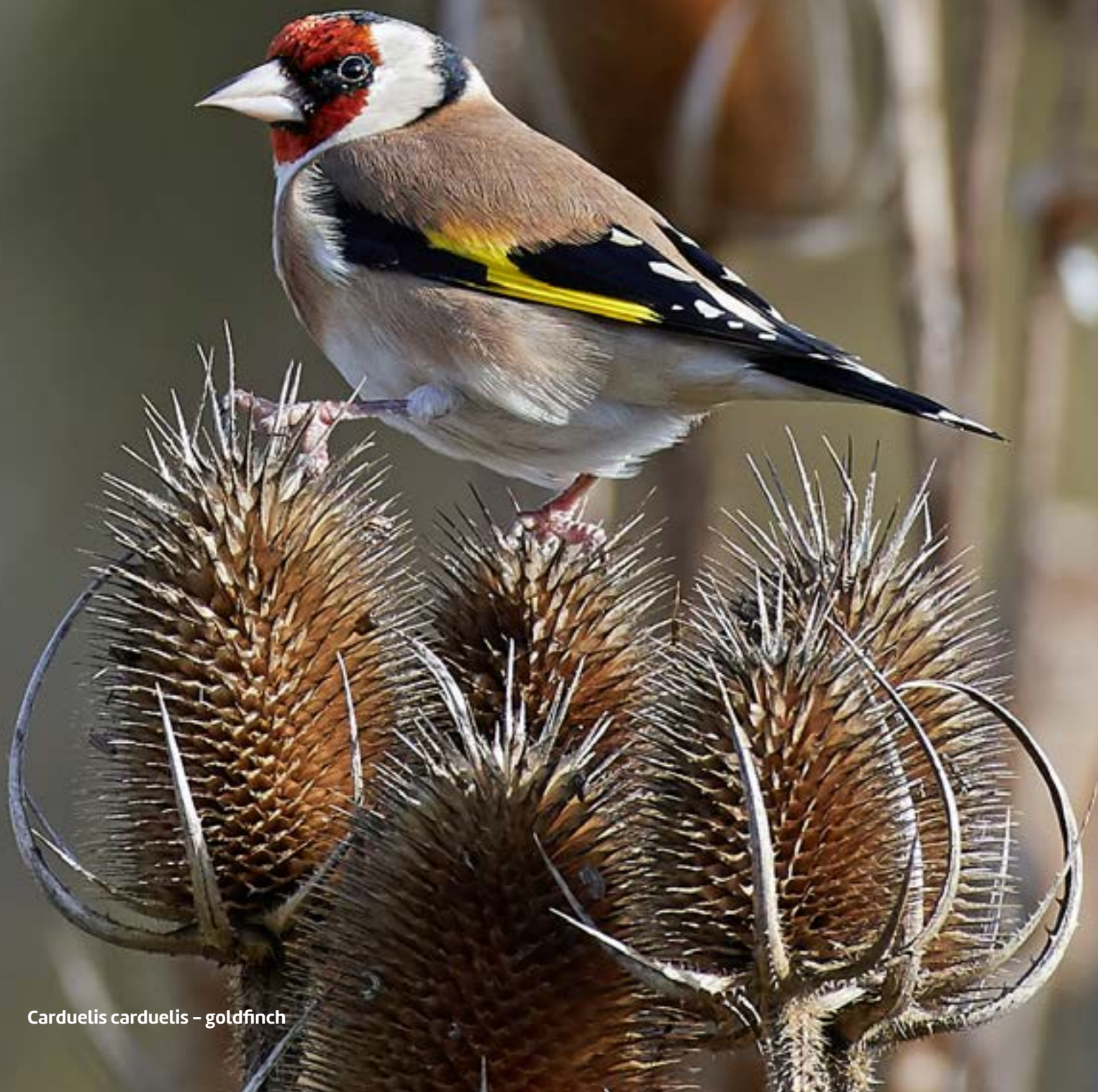
Carduelis carduelis - goldfinch