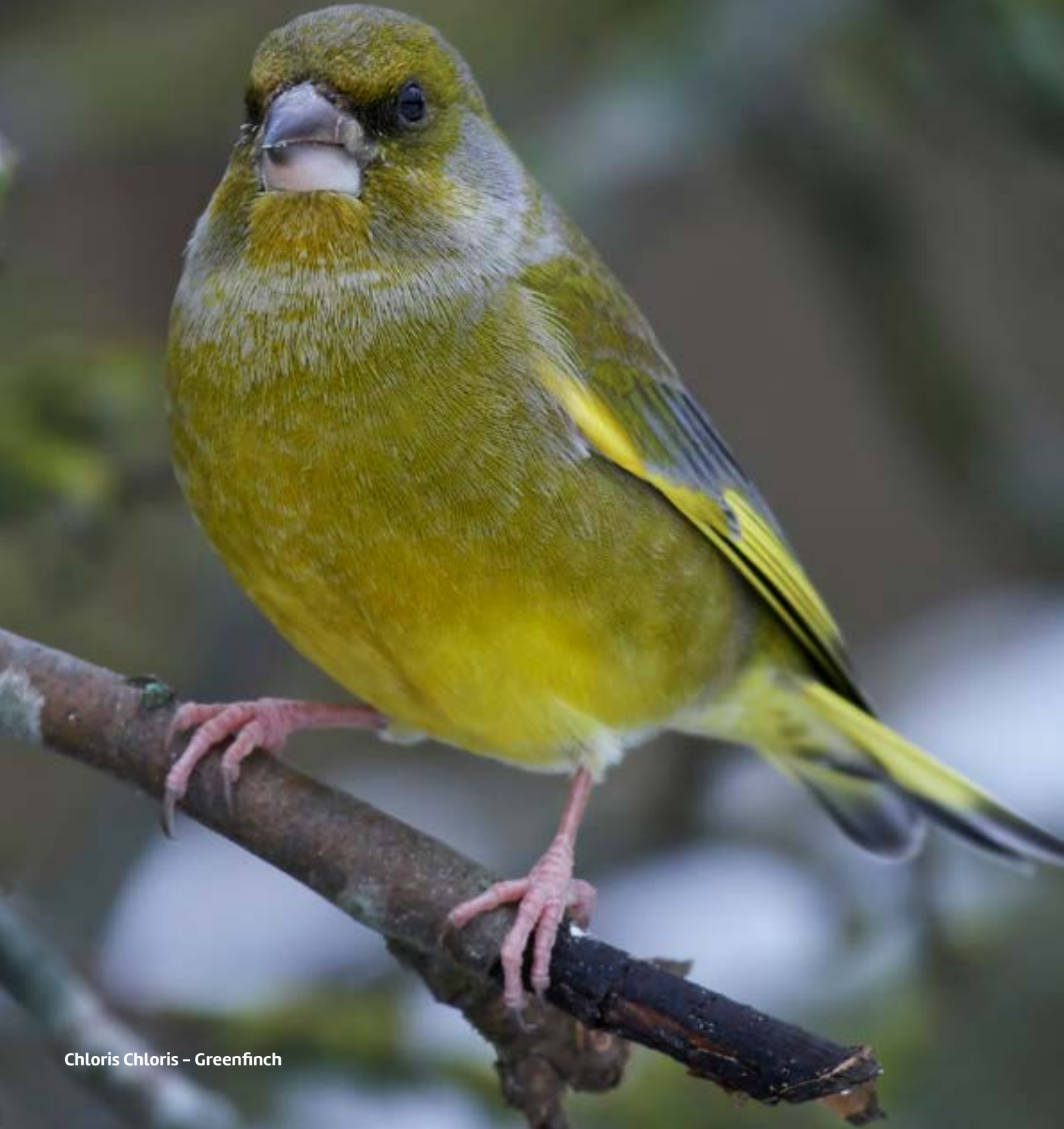
Chloris Chloris – Greenfinch