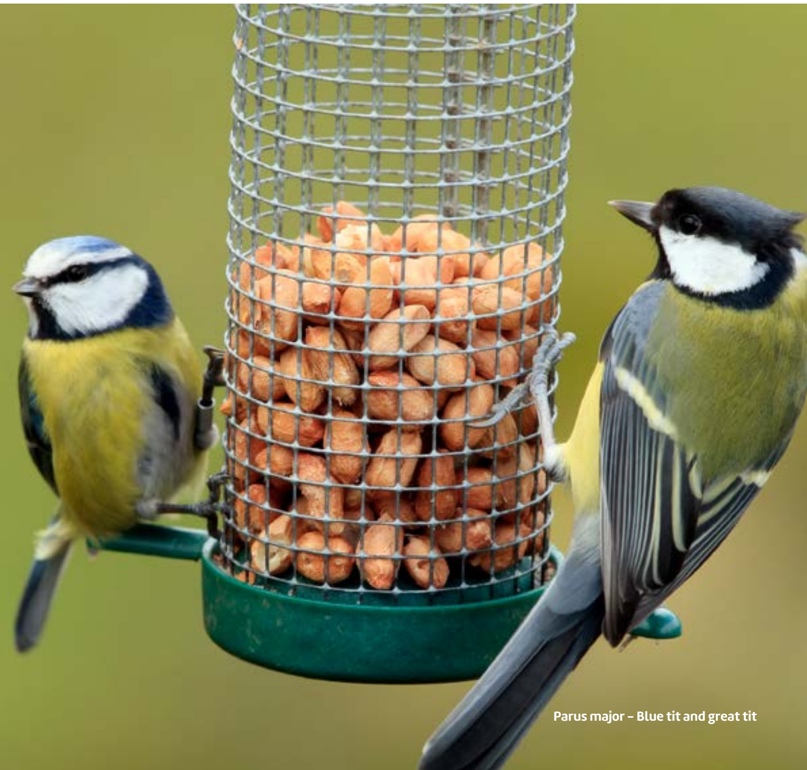
Parus major – Blue tit and great tit