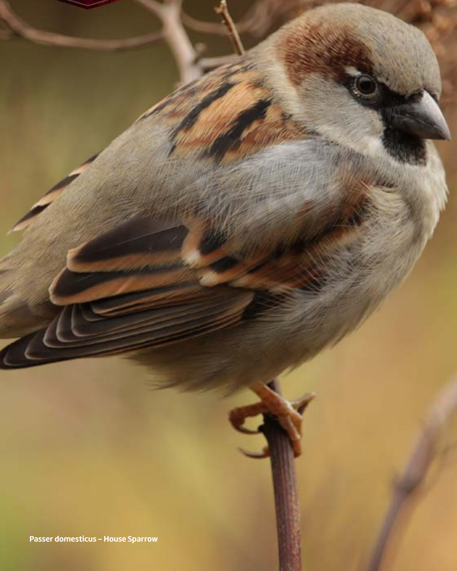
Passer domesticus – House Sparrow

HobbyFirst WildLife Small packs in display box