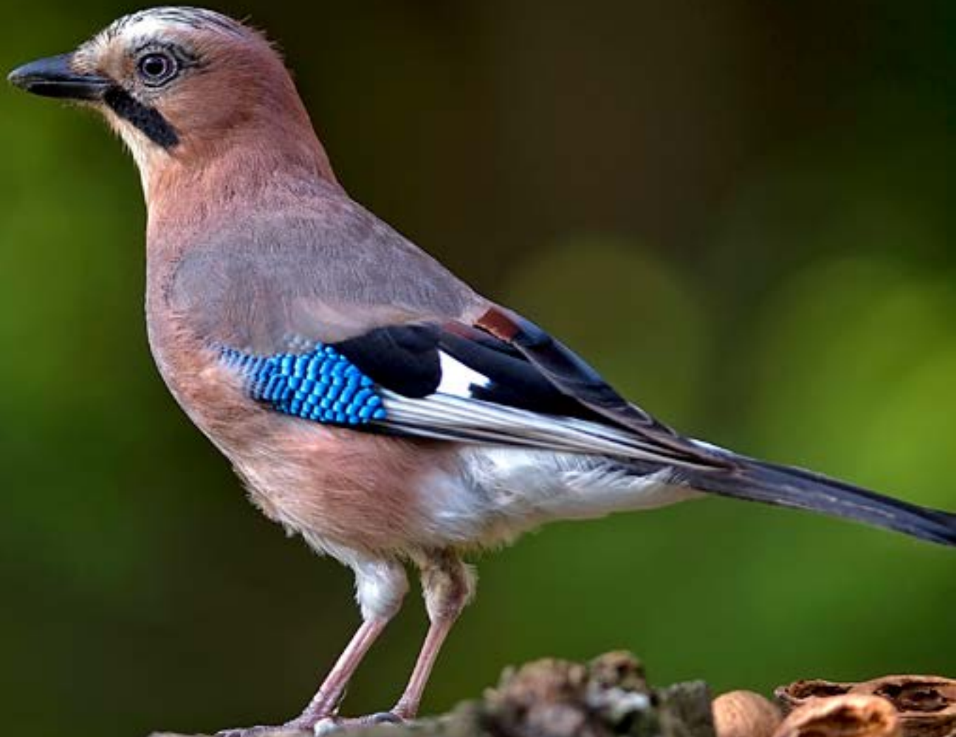
Garrulus glandarius- Jay