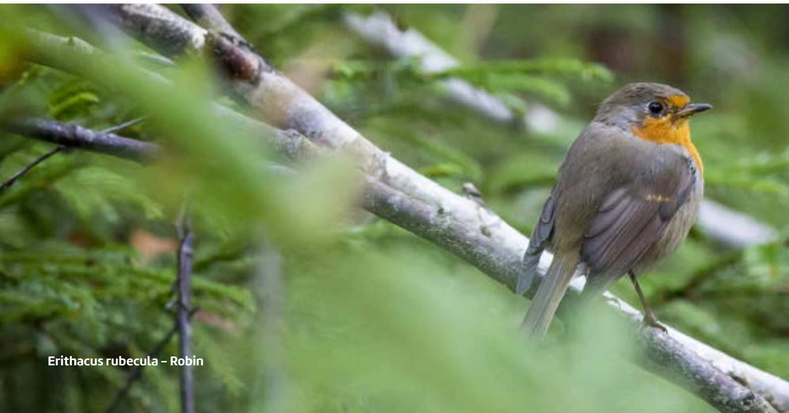
Erithacus rubecula – Robin