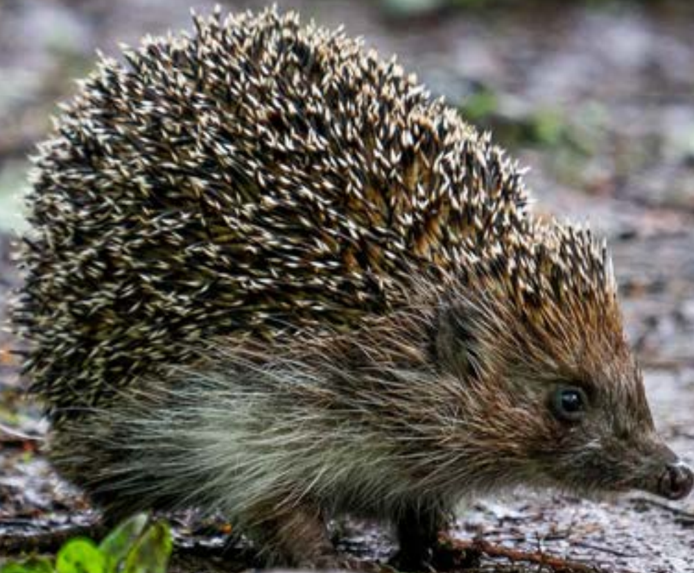
Erinaceus Europaeus – Hedgehog

HobbyFirst WildLife Small packs for Garden Visitors