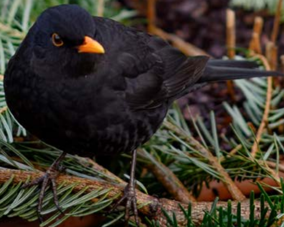
Turdus merula - Blackbird