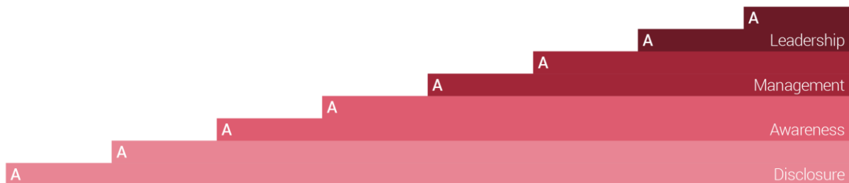
Figure 2 – Figure showing the progression of final CDP letter scores and bands between scoring levels.