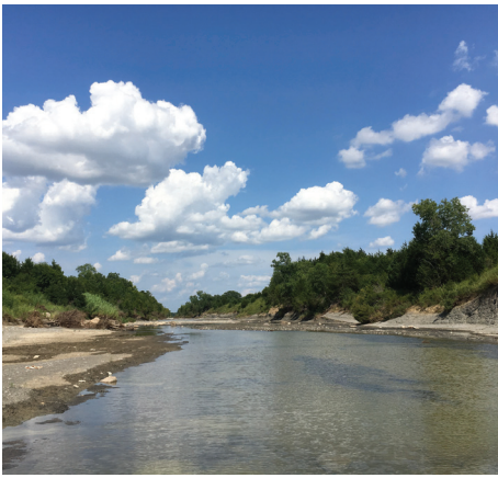
Lake Ralph Hall will reduce the effects of severe erosion on the North Sulphur River channel (now over 300 feet wide).