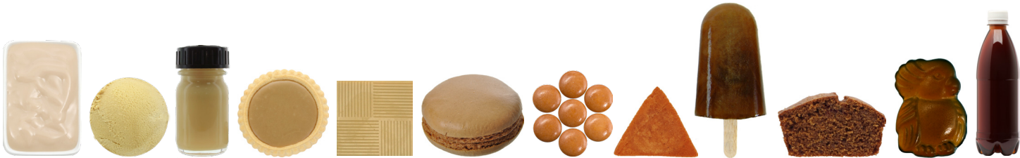
Product overview with recommended applications