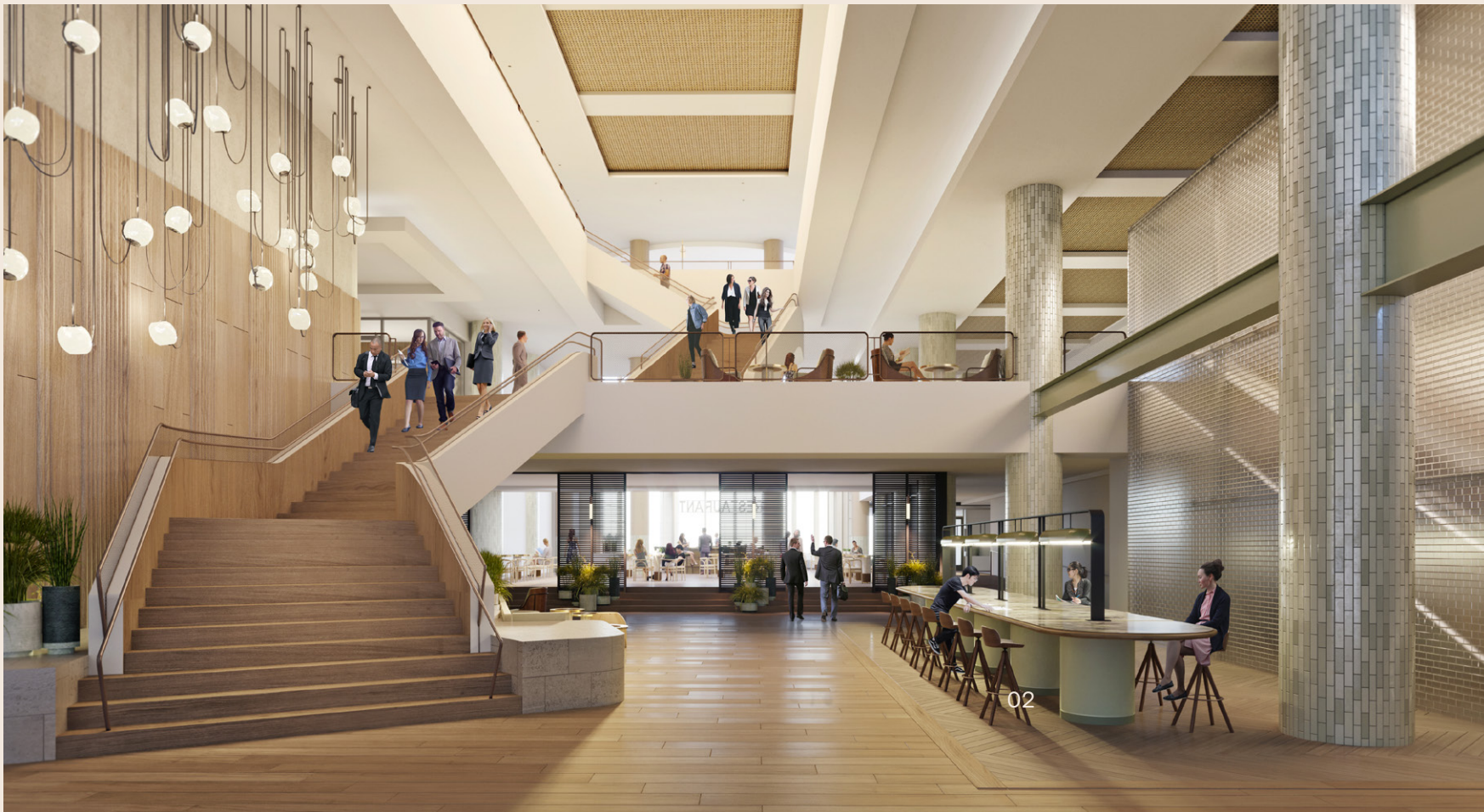
Tenant Office Lobby

An inspiring new street-level space in downtown Seattle, Cedar Hall brings together the best of Pacific Northwest city life for all.