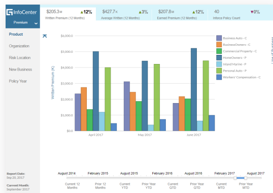
Premium analysis application