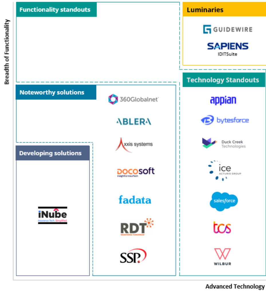
Figure 1: Celent Technical Capability Matrix – Asia Pacific