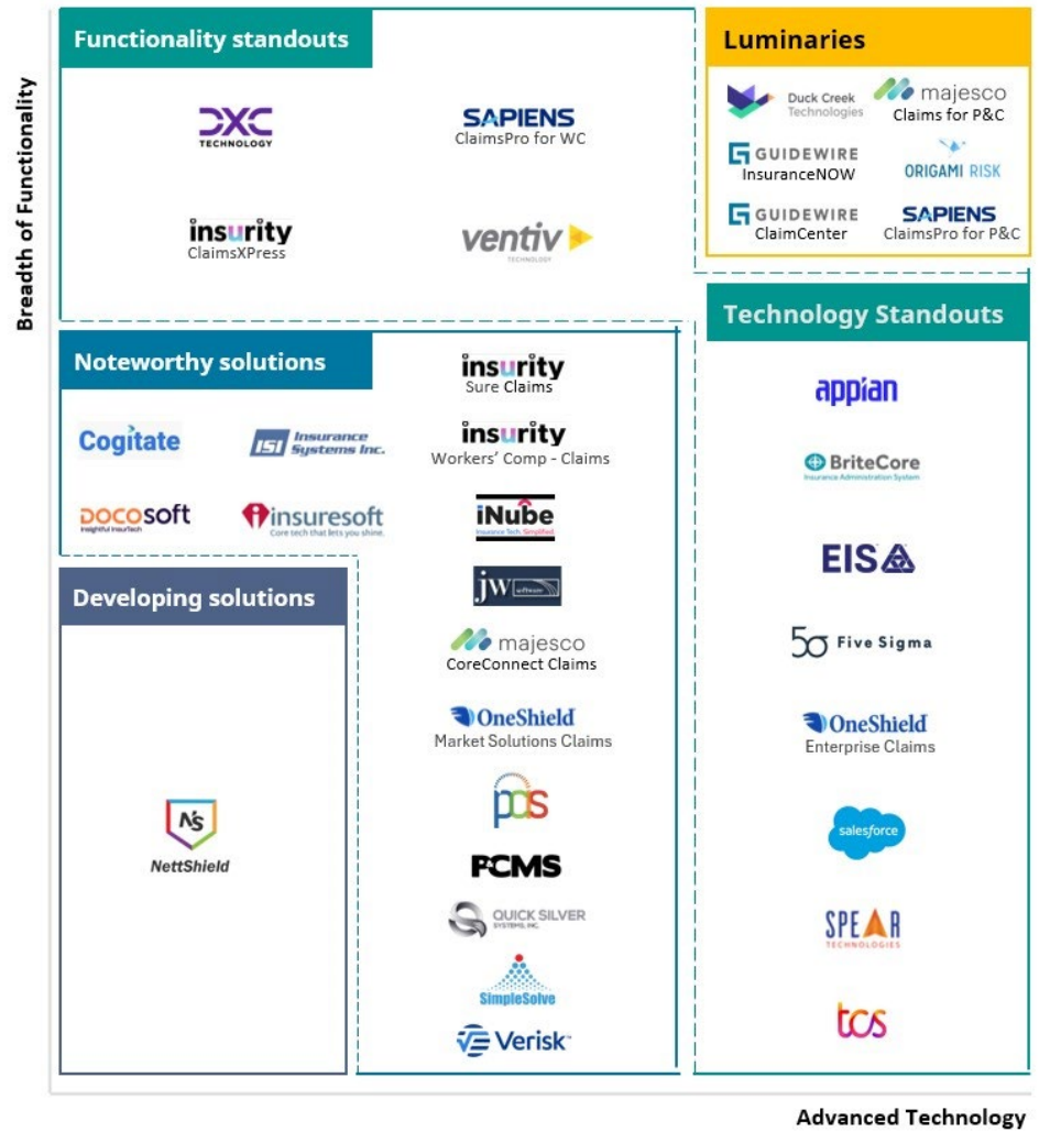
Figure 1: Celent Technical Capability Matrix – North America