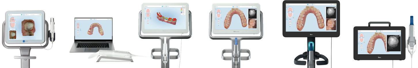
iTero Element Restorative Foundation Certified Pre-Owned intraoral scanner

Show patients what their restorative outcomes could look like 7