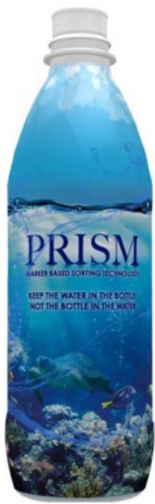
Figure 1: Application of chemical tracers and digital watermarks

However, it is important to investigate how these technologies fit in the broader recycling ecosystem and actually contribute to a circular economy for plastics.