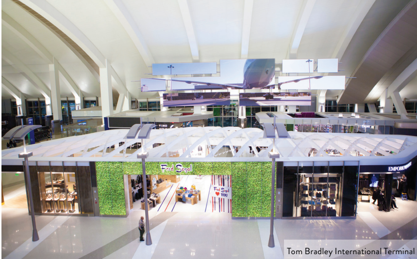
Tom Bradley International Terminal