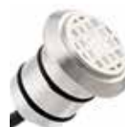
16149SS, CBR Honeycomb