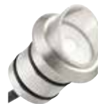
16142SS, CBR Cowl

Use the Kichler 12V Integrated LED All-Purpose Recessed Light practically anywhere to create a dynamic lighting effect. Versatile and functional, this landscape light can be embedded in concrete to mark a path, installed over a patio to deliver ambient light, or in the ground to uplight trees or walls for beauty and safety. Add on one of our accessory tops for more application possibilities and to create various lighting effects.