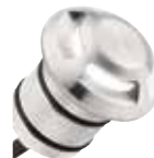
16145SS, CBR 4-Way Opening