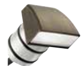
16143CBR, SS Side Fire Sconce