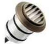
16146CBR, SS Louver