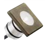
16147CBR, SS Square Trim