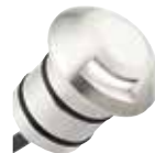
16148SS, CBR Single Opening