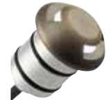
16144CBR, SS 2-Way Opening