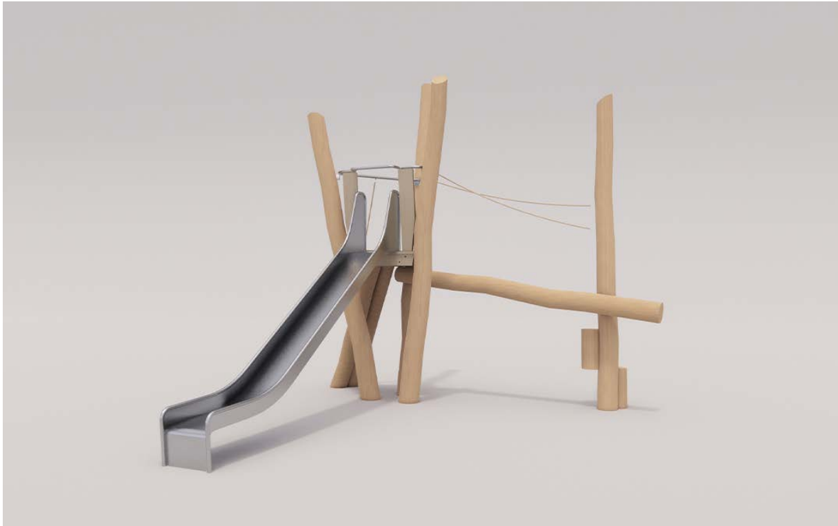
* STAINLESS STEEL CONFIGURATION SHOWN, PLASTIC SLIDE AVAILABLE.

The Slide Platform 1800 is a great way to incorporate a slide into your senior adventure playground area. The triangular slide platform shape means there are three routes of access and egress. One side is a slide (choose plastic or stainless steel), one side has angled notched logs and one side has a log and rope.