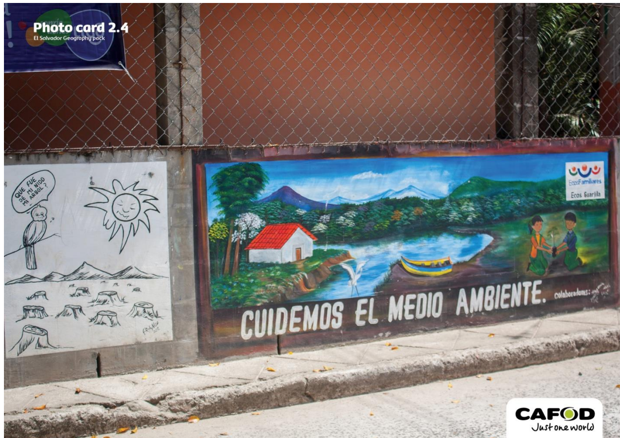
Photo card 2.4: Focus on Karen's community and caring for the environment