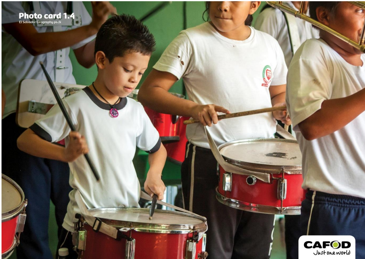
Photo card 1.4: Focus on Diego's community and physical and human features