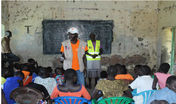
Photos taken during GBV awareness raising to girls of reproductive age in school.