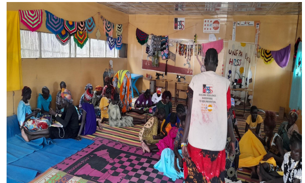
Photo taken during PSS at WGFS for survivors.