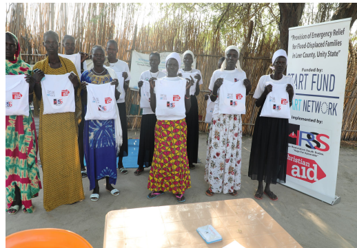
Photo taken during distribution of menstrual hygiene kits to women and girls.