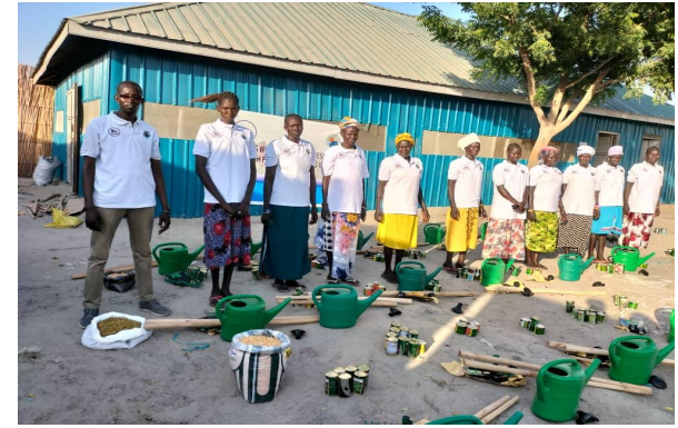
Photo taken during distribution of Farm tools and seeds to beneficiaries.