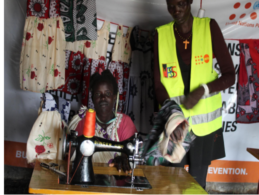
Photos taken during women skills training in tailoring at the WGFS