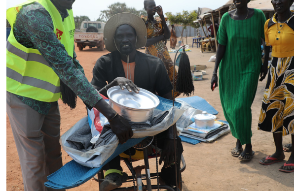
Photos taken during distribution of NFIs.