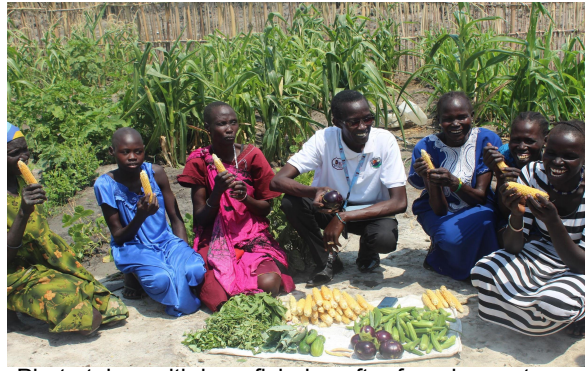
Photo taken with beneficiaries after farm harvest during HRSS monitoring and evaluation.