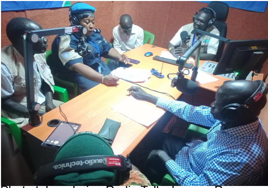
Photo taken during Radio Talk show on Peace and community cohesion in Rubkona.