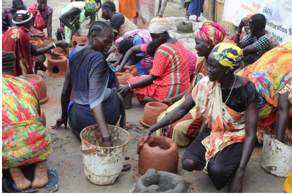
Photo taken during women skills training at the WGFS