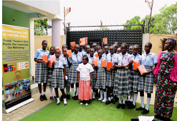
Photo taken during distributing scholastic items to schoolgirls and awareness session.