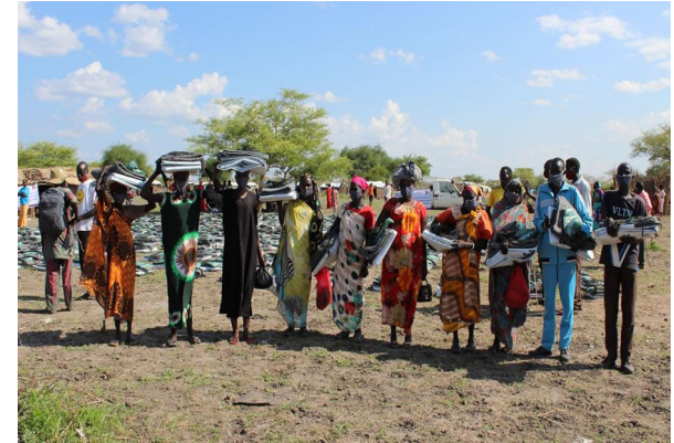
Photo taken during distribution of Non food items.