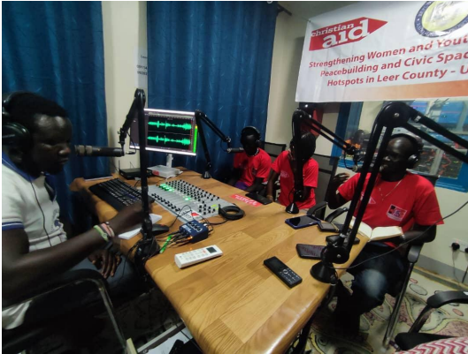
Photo taken during Radio Talk show on Peace women peace and security.