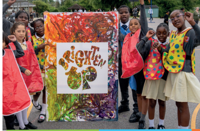
St Chad's Catholic Primary School

You are already living out Catholic Social Teaching at your school. Think of ways to embed CST at the heart of school life to ensure long term commitment to justice.