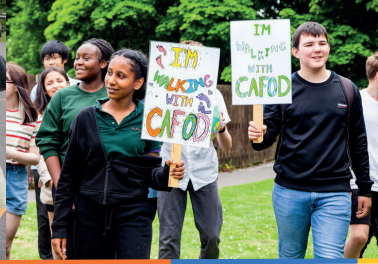
All Saints Catholic High School