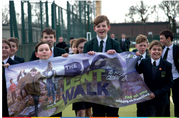
St Edmund Arrowsmith Catholic High School

We are invited to reflect on our pilgrim journey through the 'pastoral cycle' of 'see, judge, act'. This methodology will help children and young people to understand issues of injustice, discern, and take action to bring about change in the light of Gospel values.