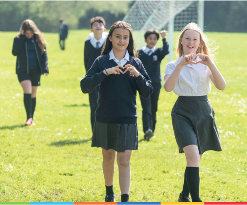
St Gregory's Catholic High School

Pope Francis has asked us to be signs of hope for others. He encourages us to put Catholic Social Teaching into action through caring for our common home and supporting our sisters and brothers who are experiencing war, hunger or poverty.