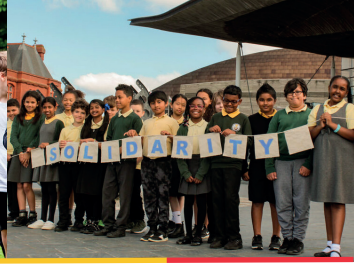
St Cuthbert's Catholic Primary School