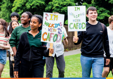
All Saints Catholic High School