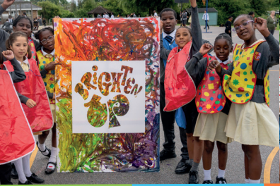
St Chad's Catholic Primary School

You are already living out Catholic Social Teaching at your school. Think of ways to embed CST at the heart of school life to ensure long term commitment to justice.