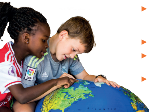
Our Lady Queen of Heaven Primary School

WE ARE PILGRIMS OF HOPE working together to build a better world