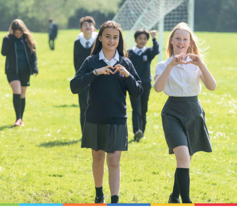
St Gregory's Catholic High School

Pope Francis has asked us to be signs of hope for others. He encourages us to put Catholic Social Teaching into action through caring for our common home and supporting our sisters and brothers who are experiencing war, hunger or poverty.