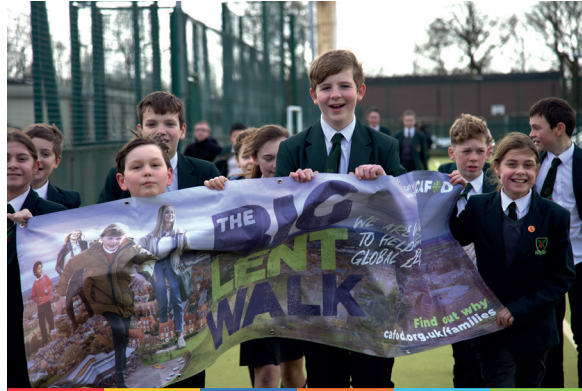
St Edmund Arrowsmith Catholic High School

We are invited to reflect on our pilgrim journey through the 'pastoral cycle' of 'see, judge, act'. This methodology will help children and young people to understand issues of injustice, discern, and take action to bring about change in the light of Gospel values.