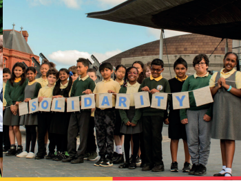
St Cuthbert's Catholic Primary School