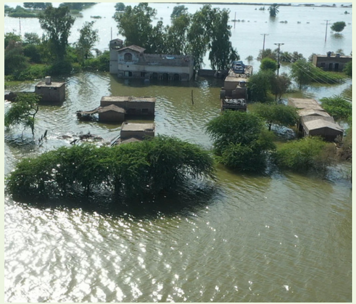
Flooding in Balochistan province, Pakistan, in September 2022. Between 10%-12% of the entire country was flooded. This is one of the costliest weather disasters in human history. Its causes are linked to man-made climate change.

In addition, each of the partner organisations has additional climate justice school resources. There is a directory of these resources at the end of this guide. Please use these resources as you wish.