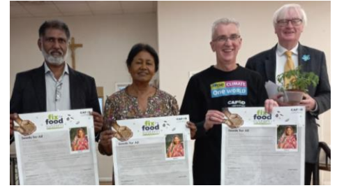
Parishioners from Enfield, Westminster Archdiocese

Over 100 parishes have had a signing of Salina's giant letter so far. In every diocese, people have been coming together to show their support for small-scale farmers, and co-sign Salina's letter to the World Bank. We're delighted with the huge response and we know many more signings are happening soon.