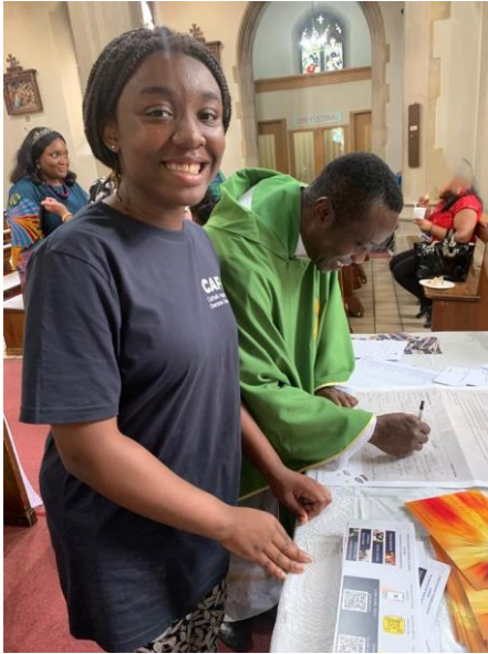
A signing at St Ethelbert, Slough, Northampton Diocese