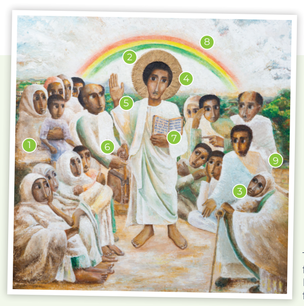
The icon portrays Jesus faithfully in the Northern Ethiopian tradition and is full of meaning: