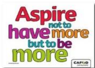
Order Aspire posters and postcards to run activities and reflections with your group.