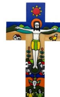
Order Romero crosses to use with your group.