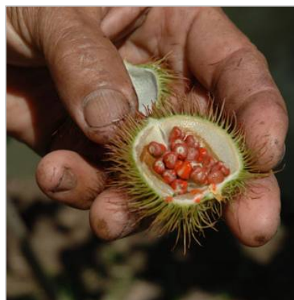
Seeds and agricultural tools