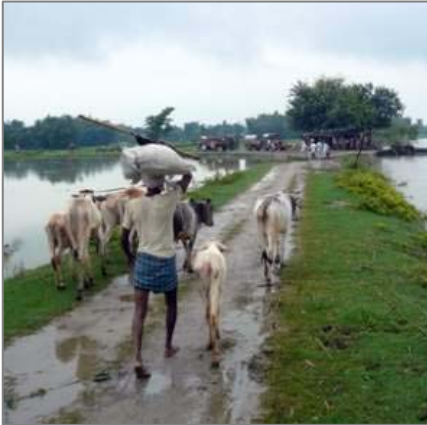
Country with high rainfall