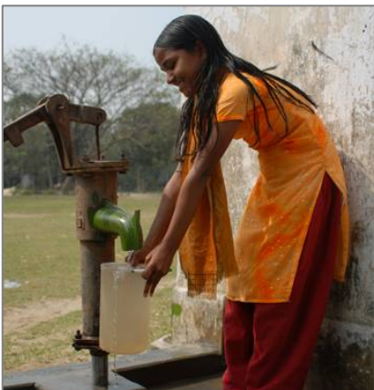
Access to clean water