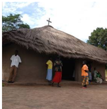
Somewhere to worship