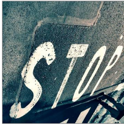
Laws and rules